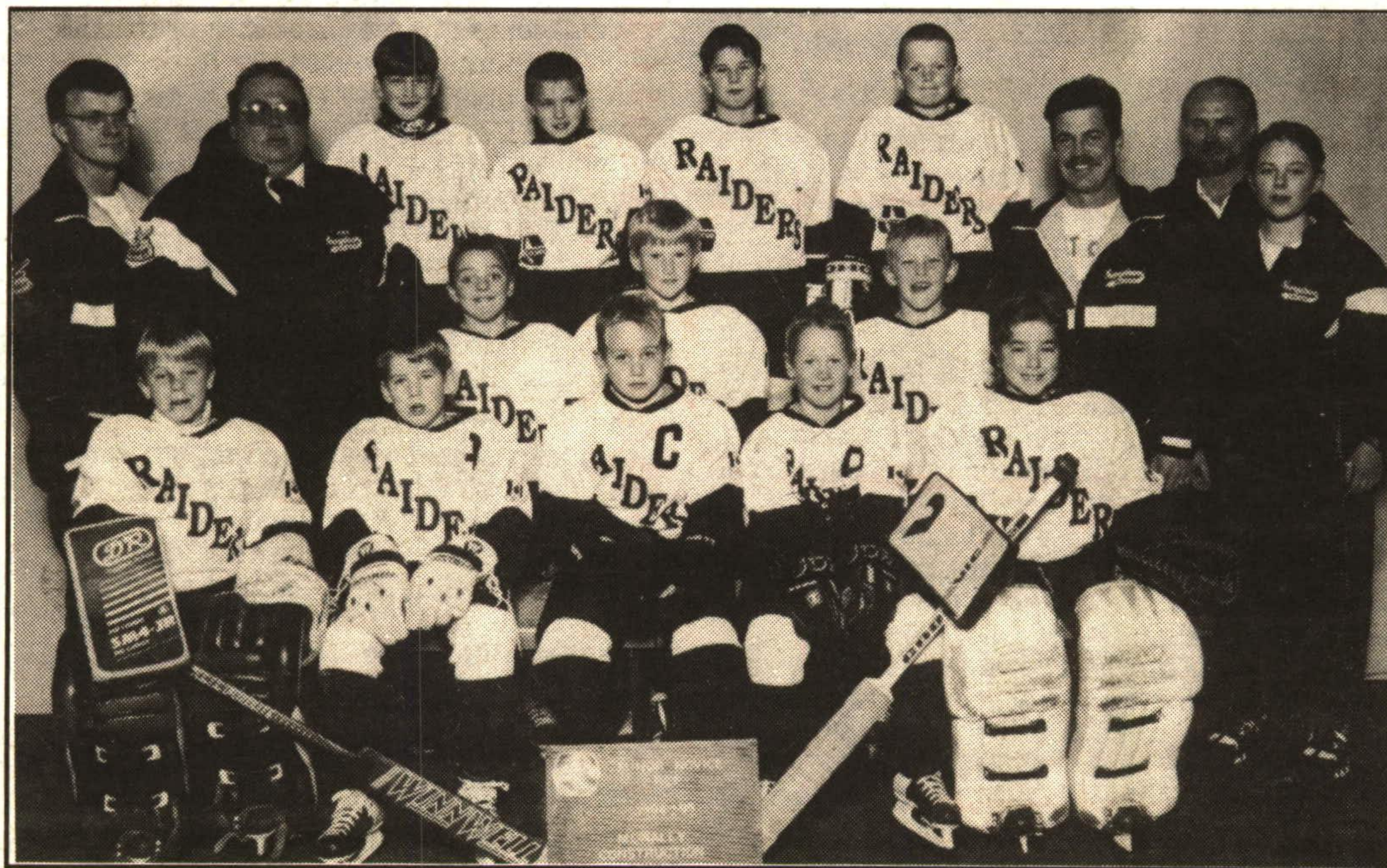
The Georgetown McNally Construction minor novice Raiders made the most of their trip to Windsor last weekend, earning

Tuition for a one week session is $300 plus GST bringing the cost to $321. Call (416) 341-1246.