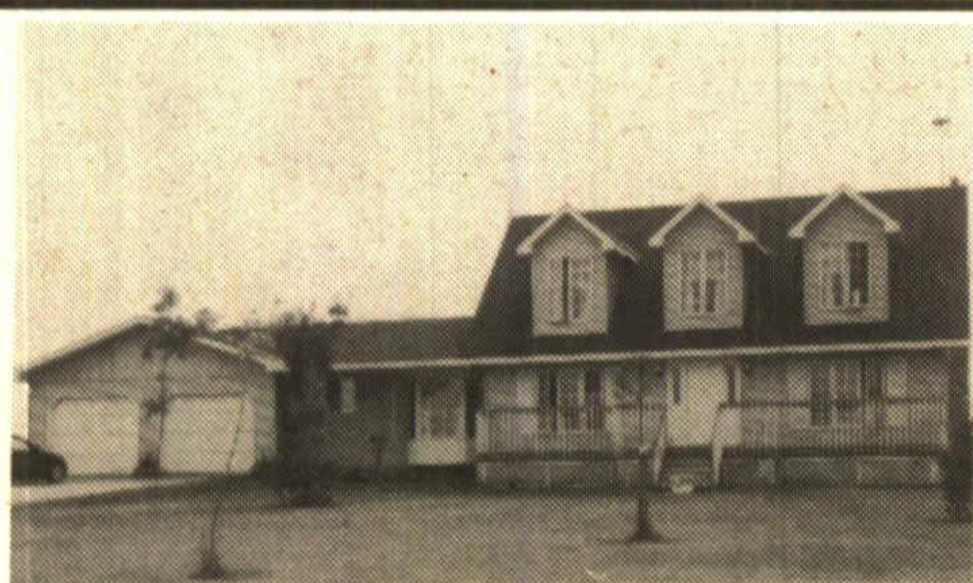
2500 SQ. FT. + 1500 SQ. FT.