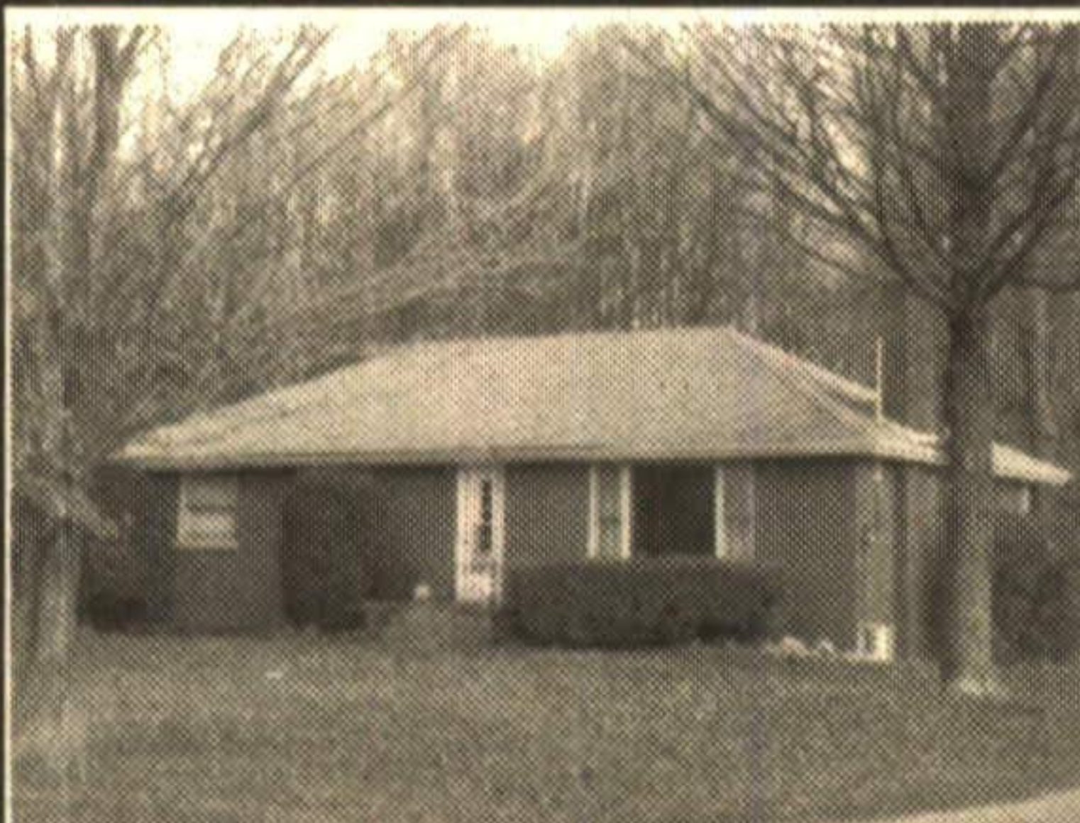
69 ACRES - LIMEHOUSE

House, barn, drive shed, stream. $329,000.