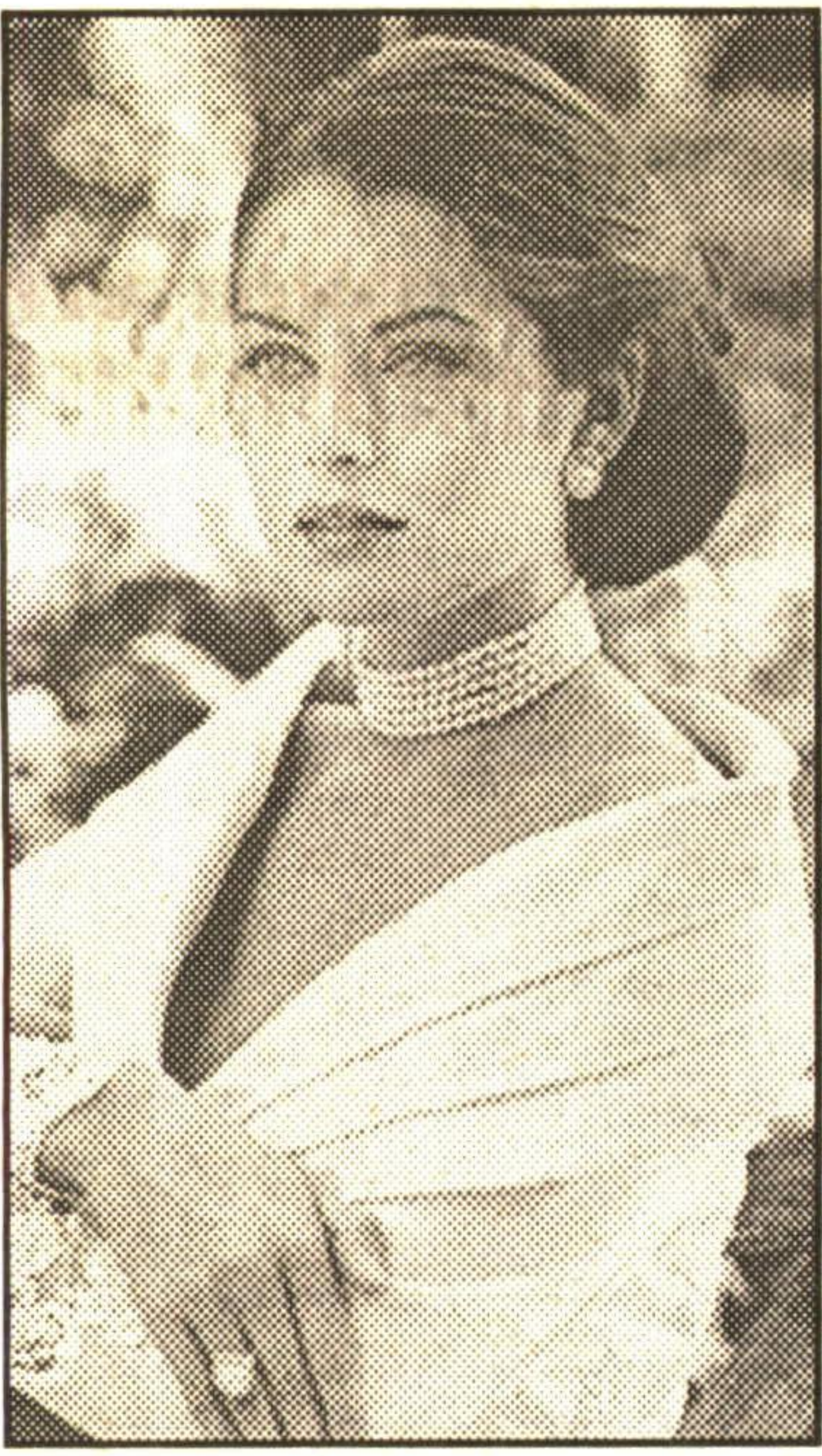
Because of their pure and lustrous look, cultured pearls have always been considered the true "wedding gems."