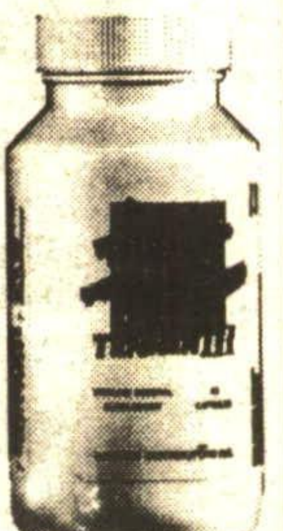
TENNEN III Vitamin Mineral Supplement Din 02117835

Controlled food intake and exercise are key components of weight loss. Tennen III dietary supplement capsules are part of the overall Supplemental Diet Plan and can provide essential vitamins and minerals which may be lacking with reduced food intake.