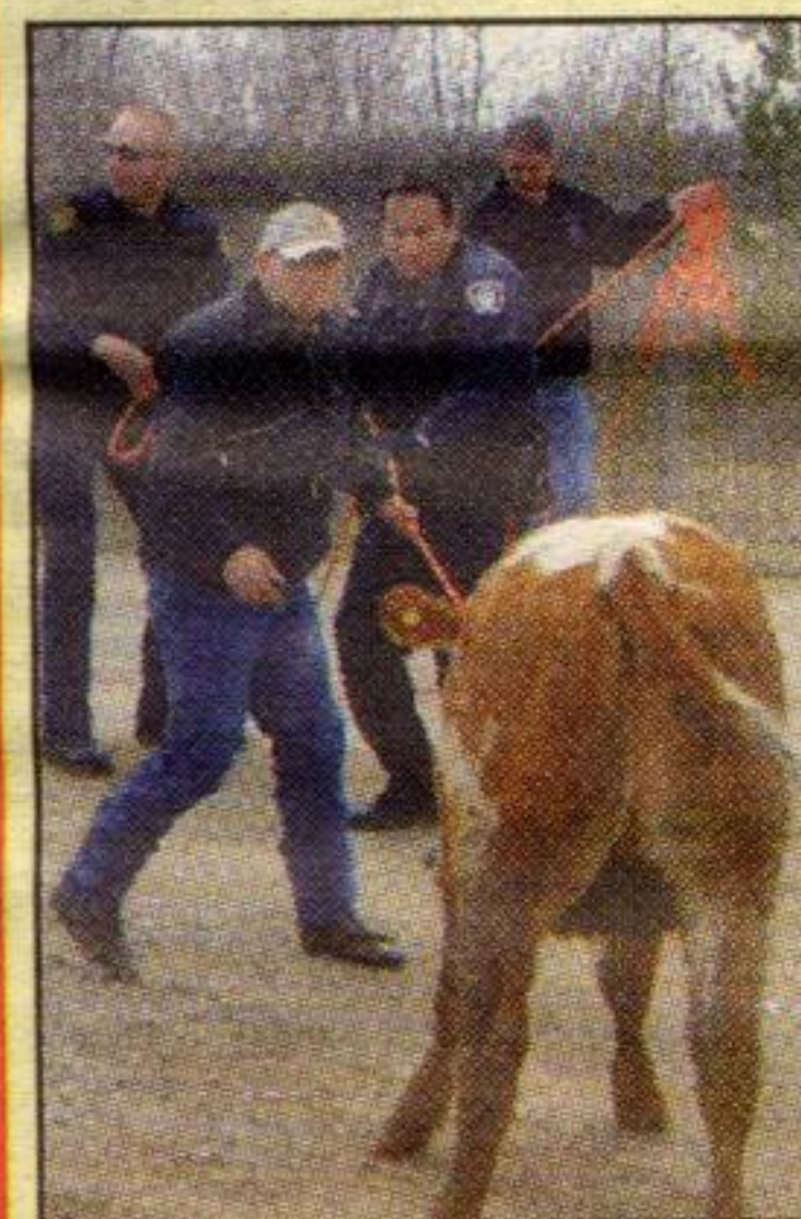
Bum Steer: Officers from Wellington OPP had an unusual chore this week. See Page 17.