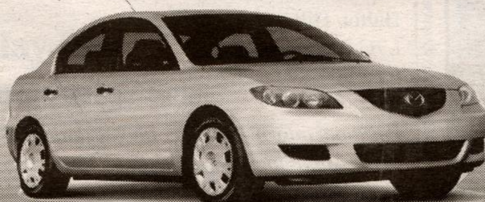
2005 Mazda3 GX