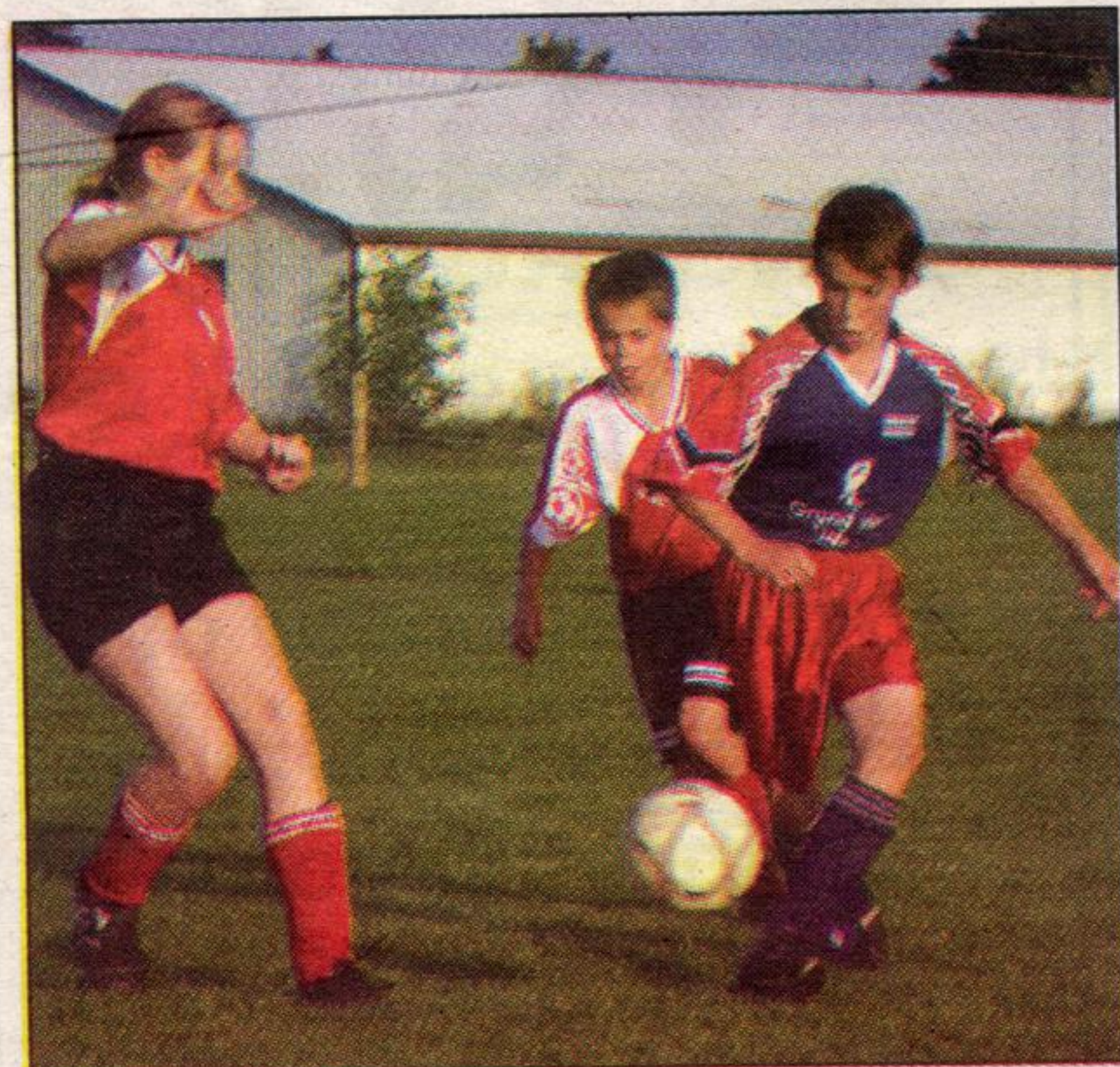
Rockwood soccer action in 2004.