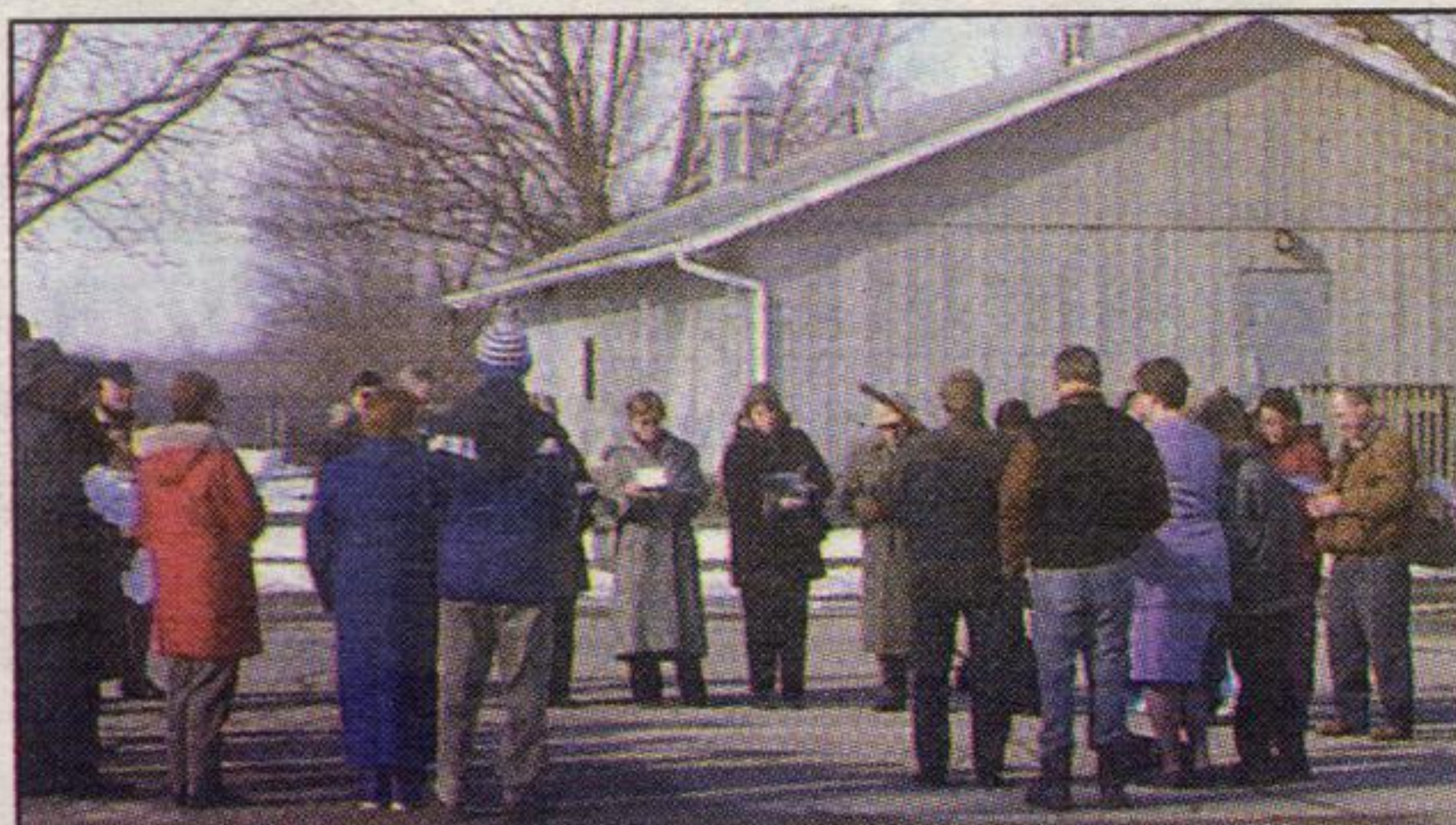
Members of Knox Church enjoyed an early morning Easter Service outdoors in Prospect Park.