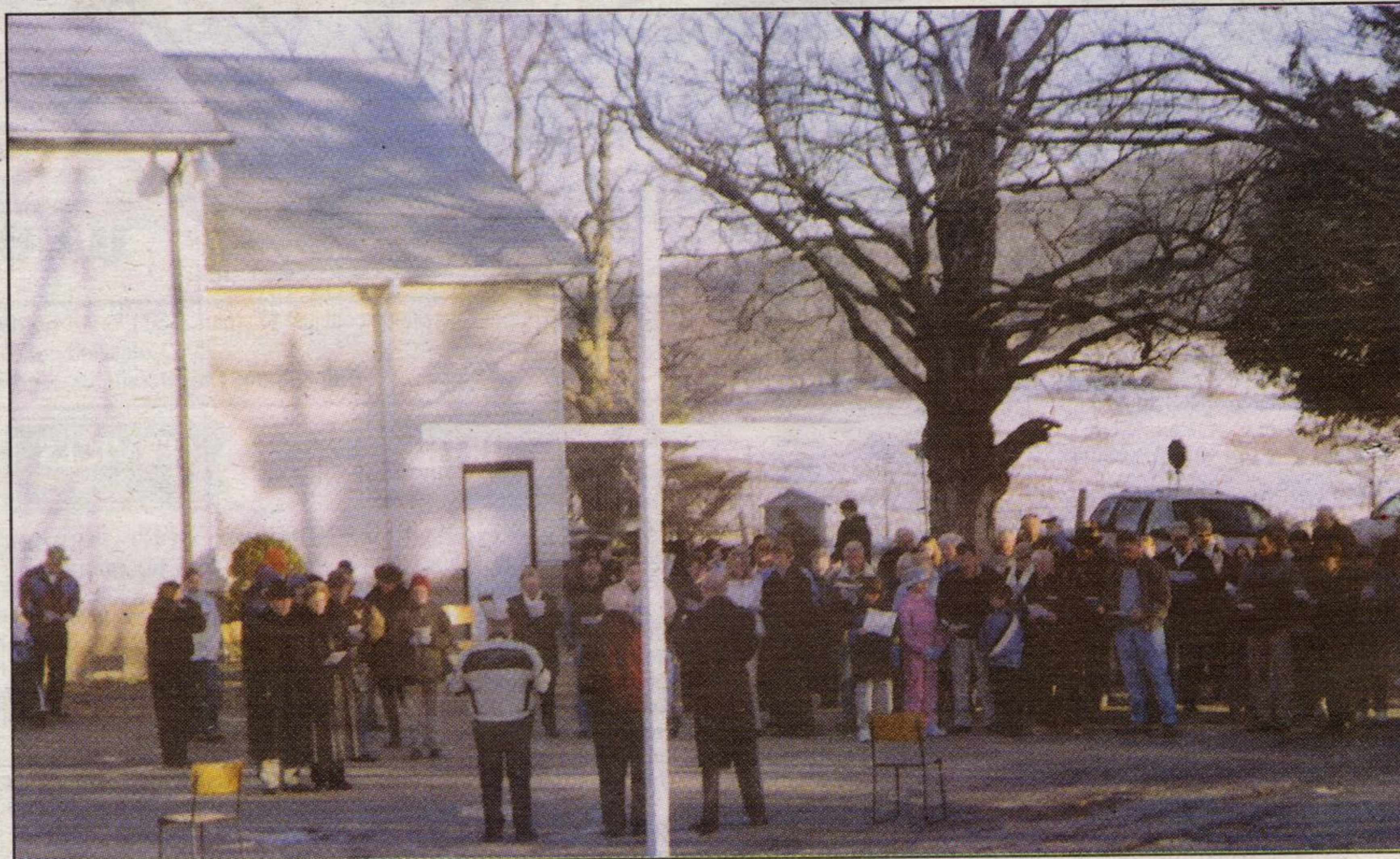
Overflow congregations at Churches on Easter Sunday.