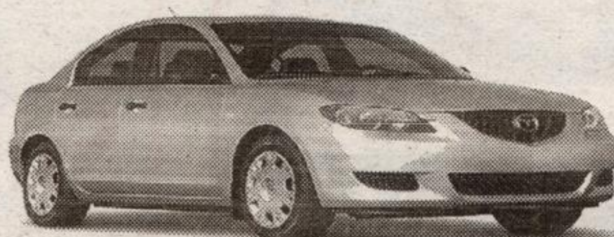
2005 Mazda3 GX