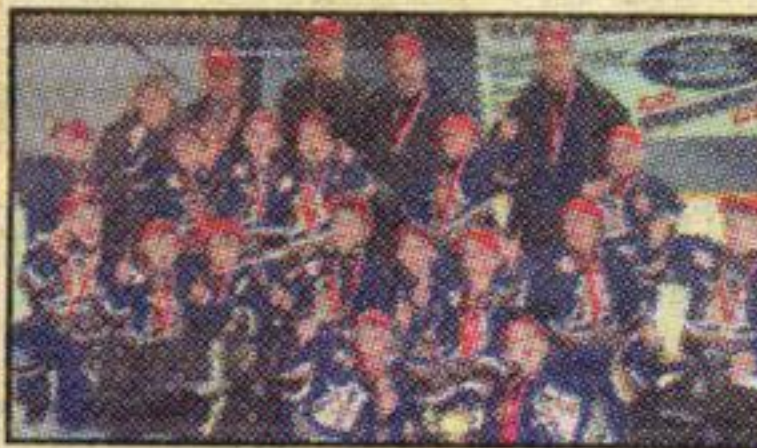
Guess which Acton minor hockey team has won an OMHA title four years running. See Page 15.