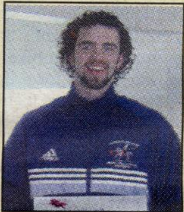
One Acton volleyball player has been named All-Canadian. See Page 14.