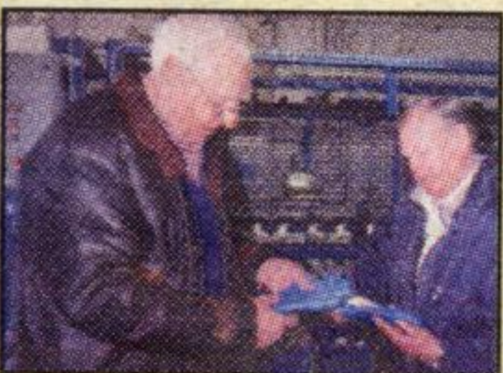
Men in Motion, a senior men's club, toured Superior Glove recently, a historic Acton business. See Page 4.