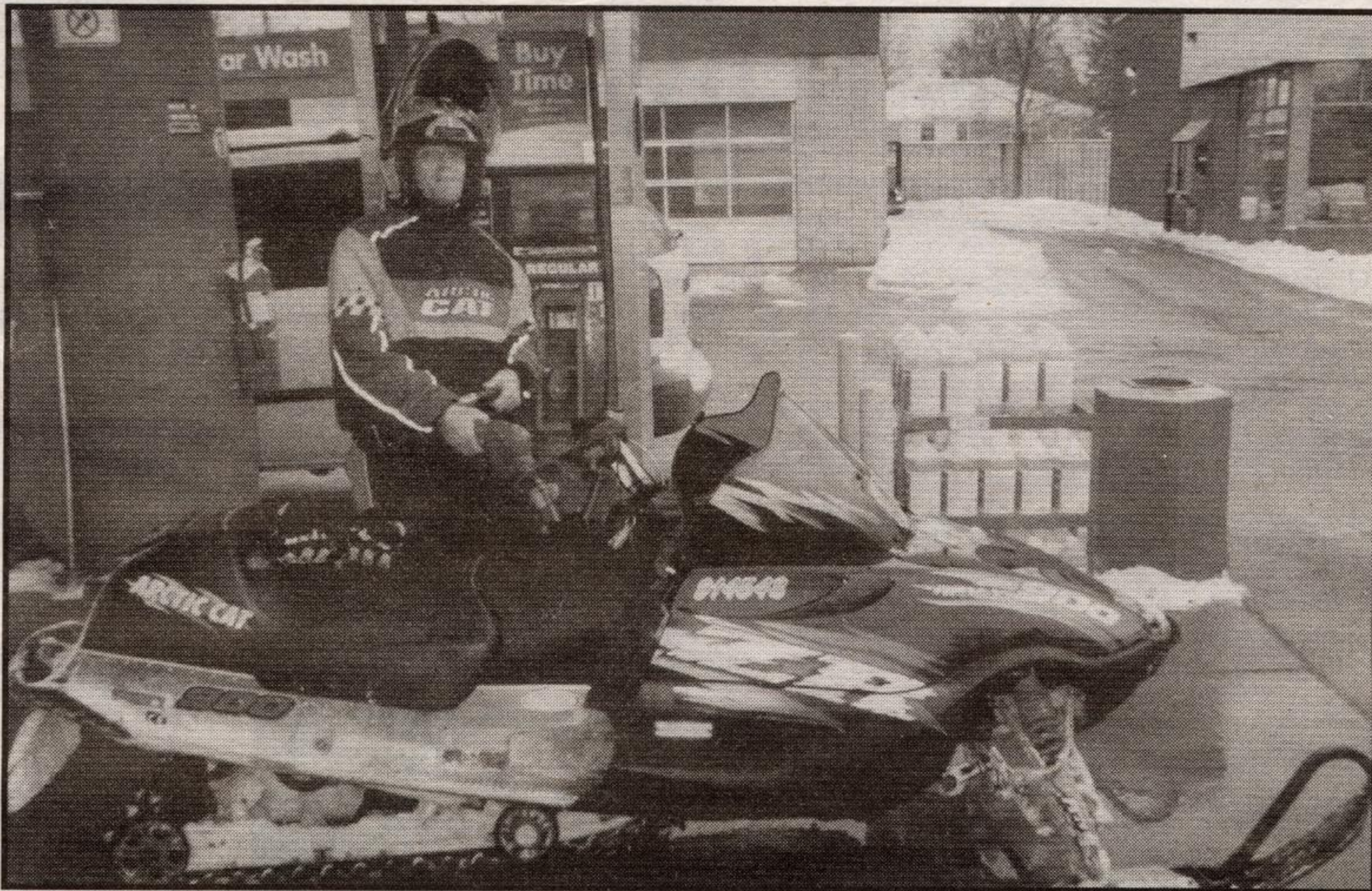
FILL 'ER UP: A Familiar sight during Acton winters, these two "snow cats" were caught in a rare quiet moment at Beaver Gas Station recently.

The folk music/java night sold out, much to the delight of organizers who hope to make it an annual event to raise money for the hall.