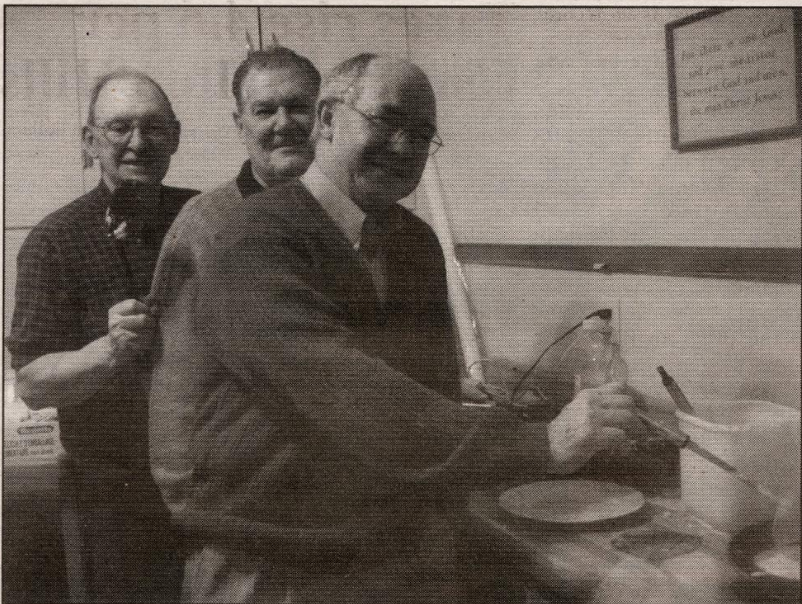
MEN AT WORK: The men of St. Alban's Anglican Church took over the cooking duties as they flipped the flapjacks for the annual Shrove Tuesday Pancake Supper. These fantastic chefs mustn't have burned one because it was a full house all evening.