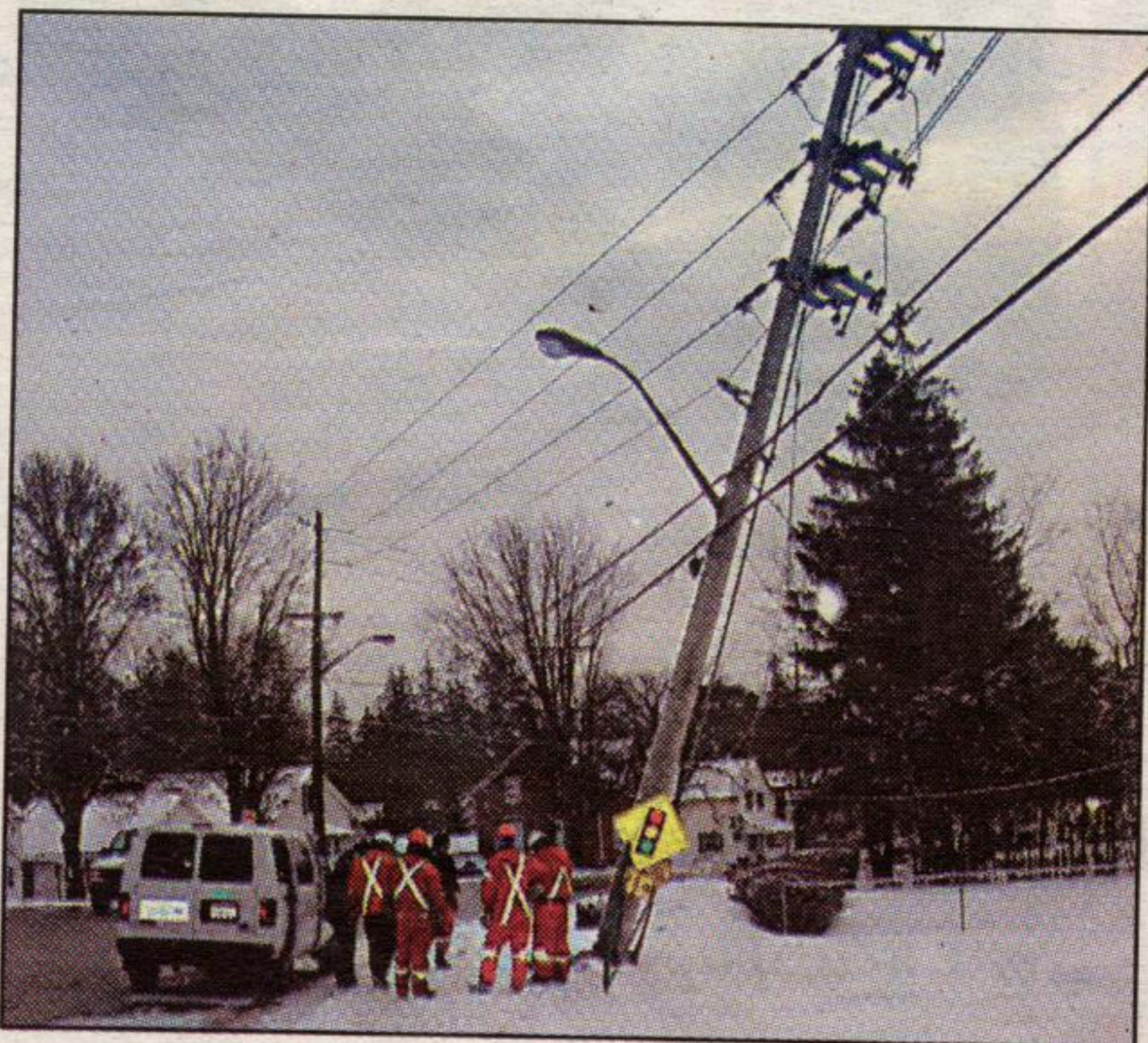
LIGHTS BLINK?: Wonder why your power shut off momentarily Wednesday morning around 8:20 a.m.? A truck clipped this hydro pole at the corner of Highway 7 and Regional Road 25 (Hwy 25) in order to avoid a head-on collision with the car ahead. Service quickly came back. Halton Hills Hydro were busy all day Wednesday putting in a replacement.

All proceeds from the event will support the youth centres of Halton Hills. For more information, or to order tickets, please call 905 873-6502, or drop by our office at 36a Armstrong Ave, Georgetown or 47 Mill St. E, Acton.