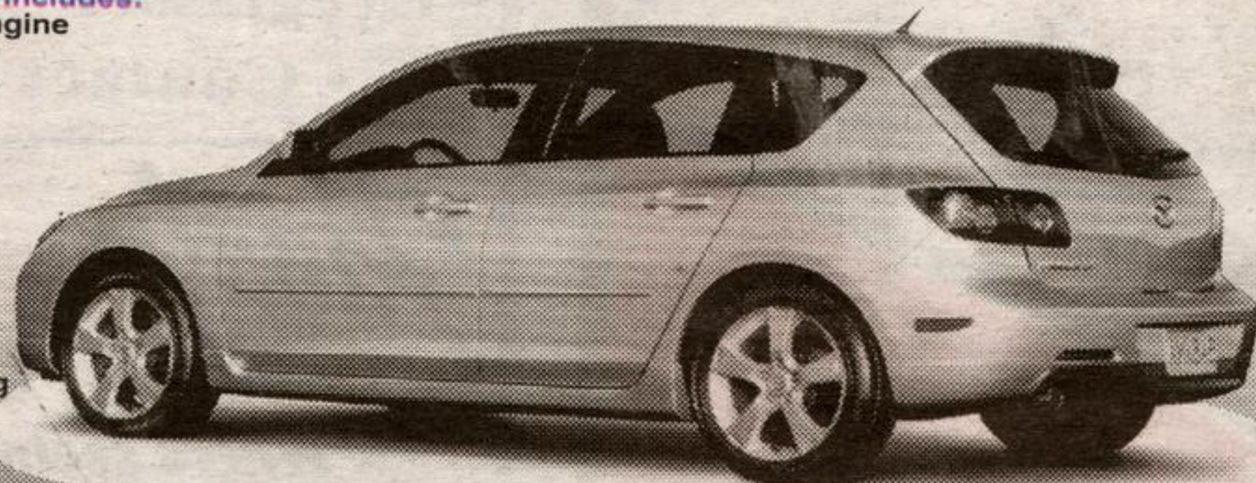
2005 Mazda3 Sport GT