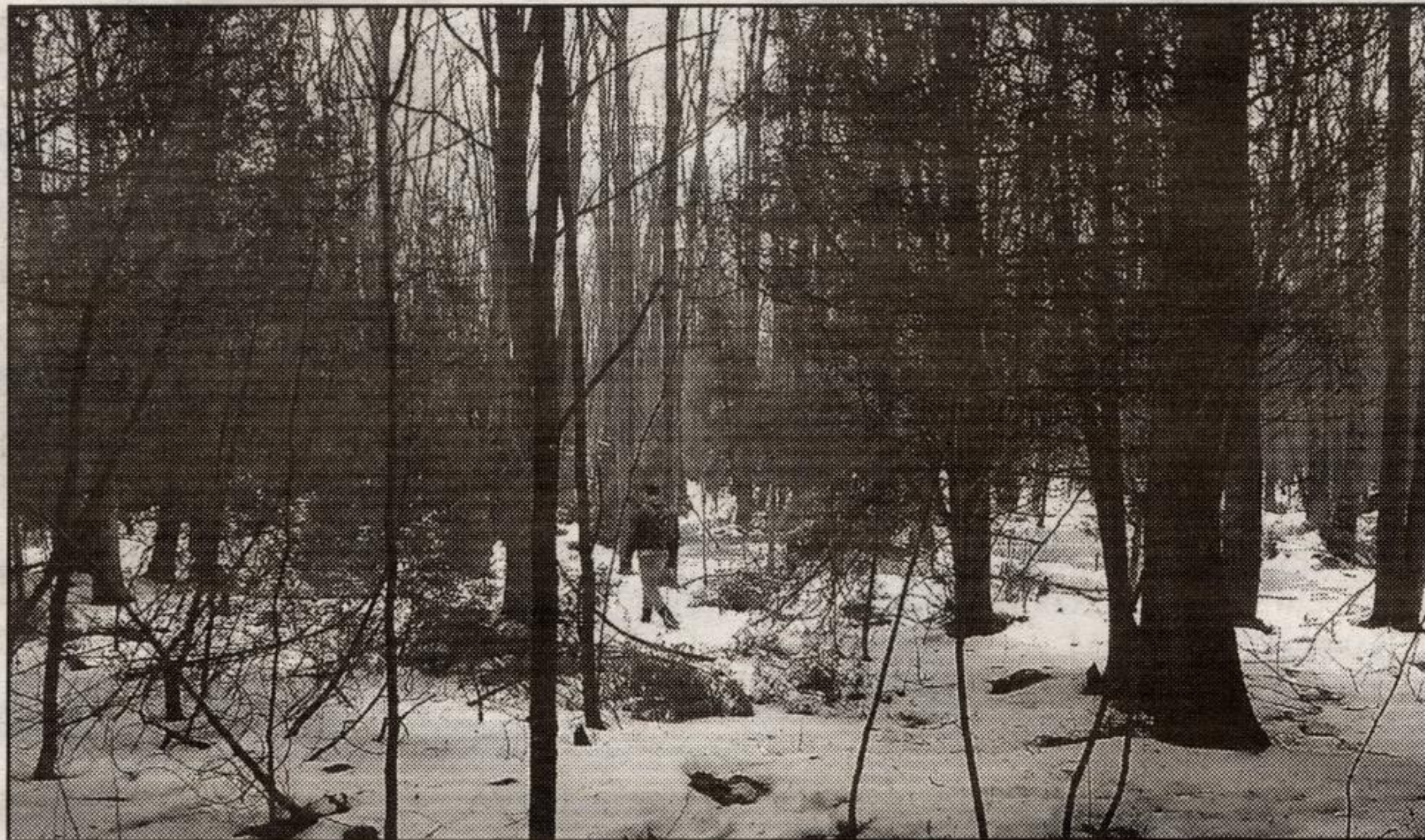
WINTER WALKING: All December's extreme weather was long forgotten by New Years Day, as temperatures rose to well above zero. This person enjoyed the serene surroundings of this wood lot on the Nassagewaya Town Line last Saturday morning.