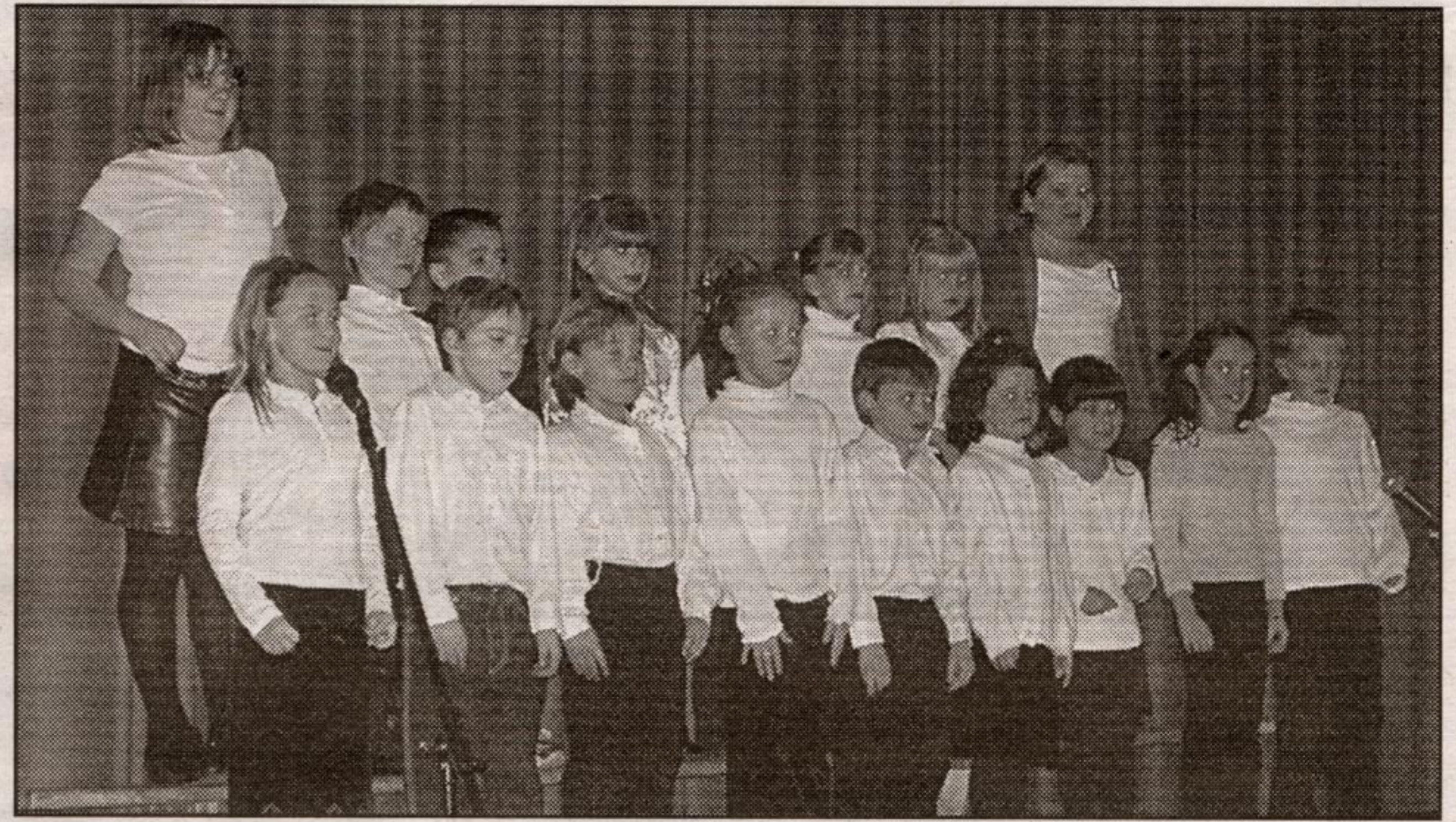
BILINGUAL MESSAGE: The McKenzie-Smith Bennett School French Choir sang Les 12 jours de noel (The Twelve Days of Christmas) at the school's holiday concert last Wednesday.