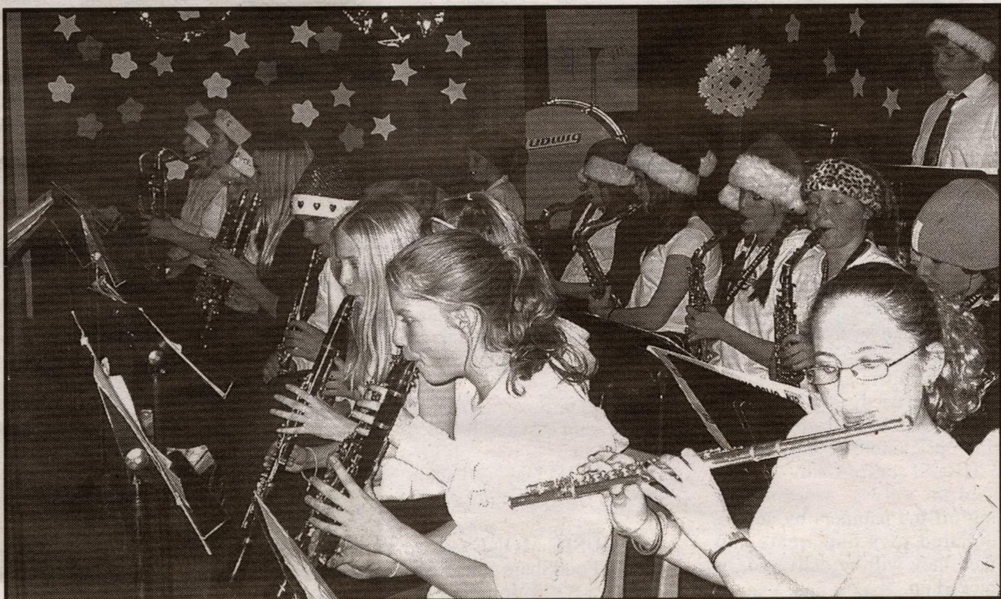
MERRY MUSIC: The Grade eight band at McKenzie-Smith School helped people get into the Christmas spirit at the school's holiday concert last Wednesday.