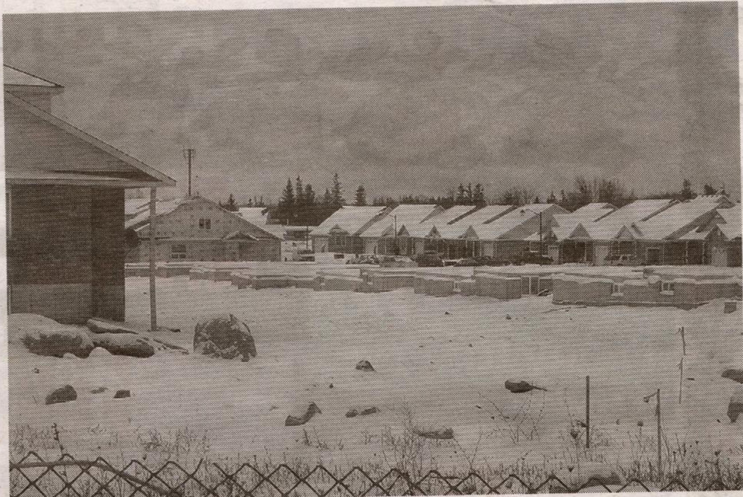
WEATHER OR NOT: Construction continues on new housing on Doctor Moore Drive in the north end of Acton off Wallace St. despite inclement weather.

(905) 854-2216 R.R. #1, Campbellville 11280 Guelph Line