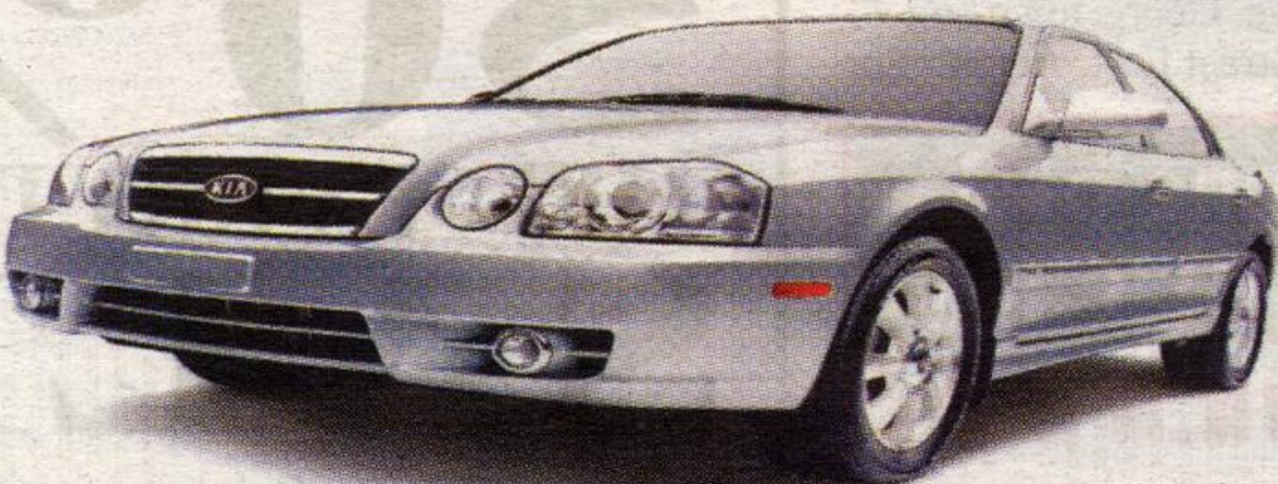
EX-V6 model shown 1