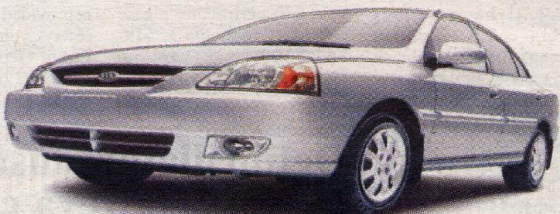
Anniversary model shown 1

WE'RE CELEBRATING FIVE YEARS IN CANADA AND SIXTY YEARS WORLDWIDE.