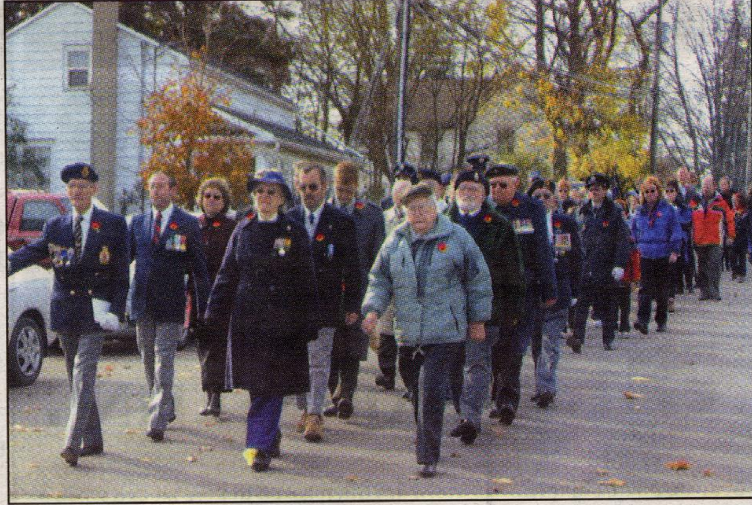
VETERANS MARCH: Rockwood and area veterans from Eramosa and Guelph townships paraded to the cenotaph in the village in Remembrance Day ceremonies as shafts of fall sunlight danced along Alma St.