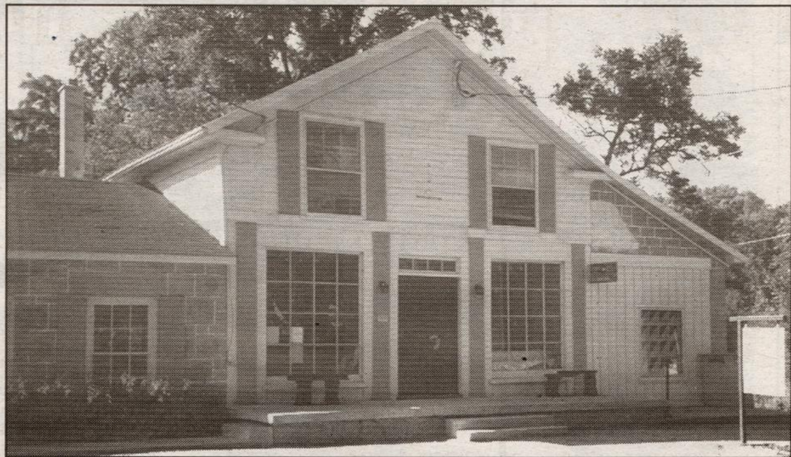
IT'S GONE: Eden Mills has lost its last store and its postal outlet. Eden Place craft store will close after the Writers' Festival on Sept. 12 and become a private residence. The postal outlet closed Aug. 31.

September 16 the new owner will take possession and turn the building into a private residence.