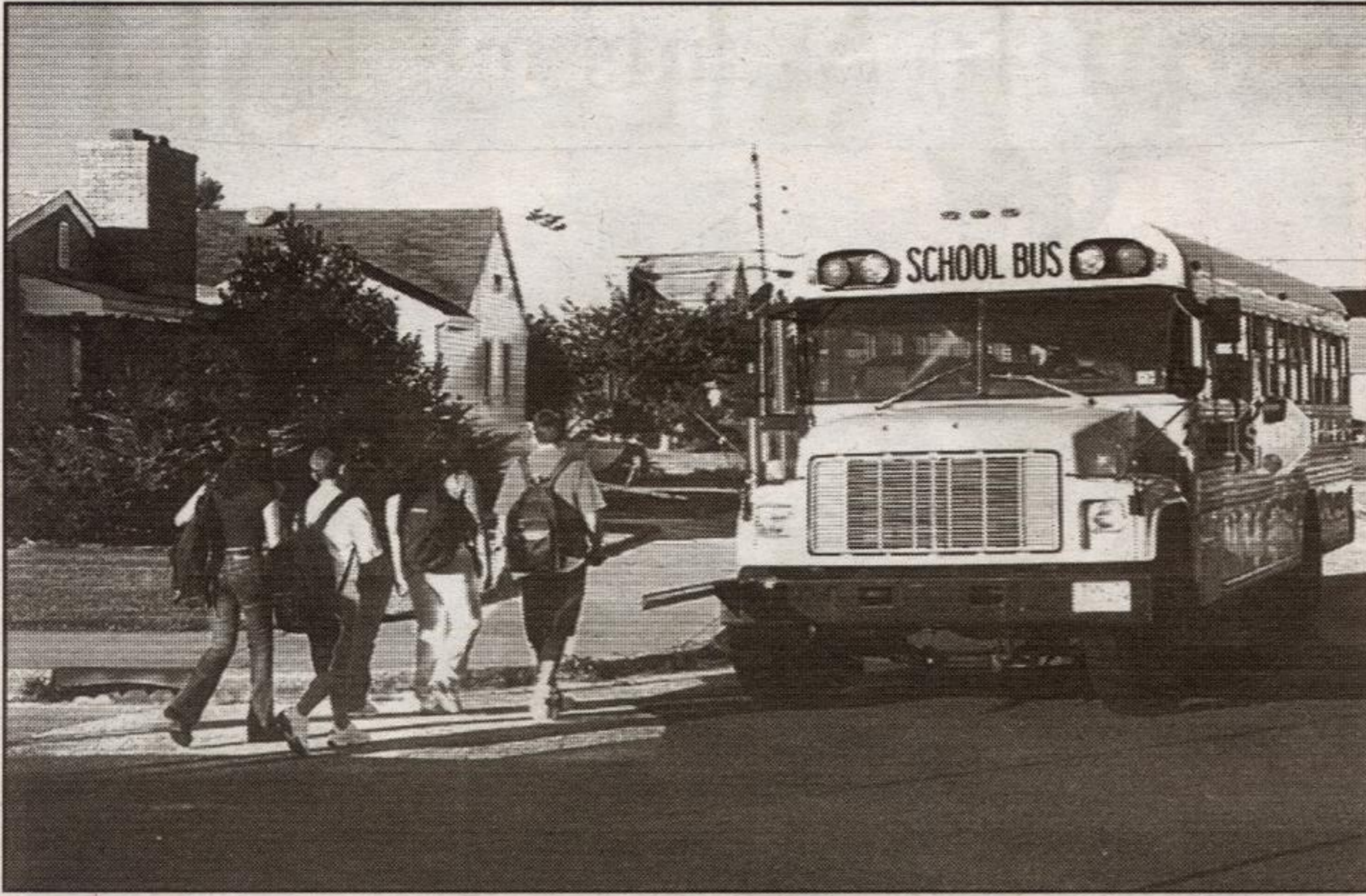
School's back next Tuesday - Please drive carefully