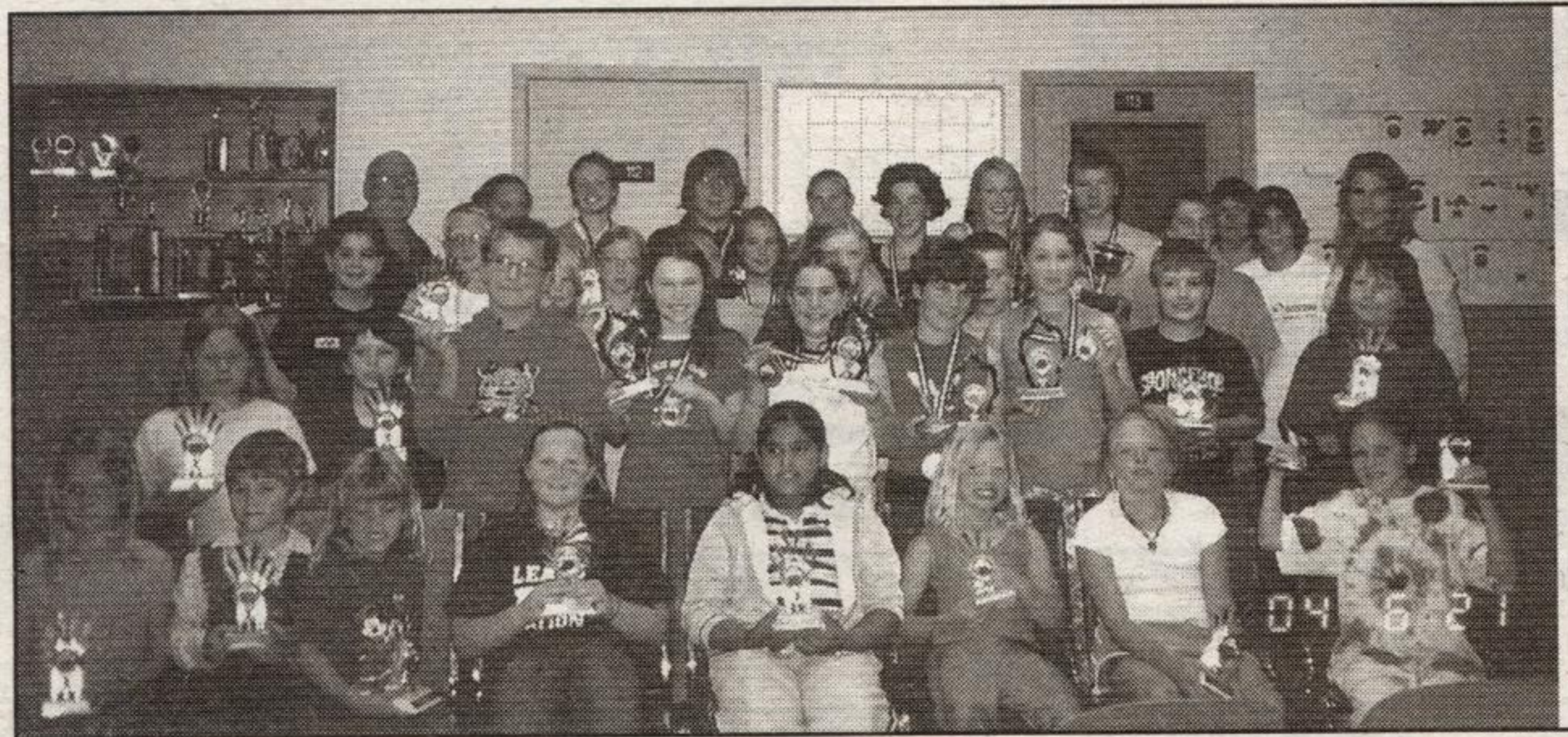
Acton Aqua Ducks and their awards. See below.