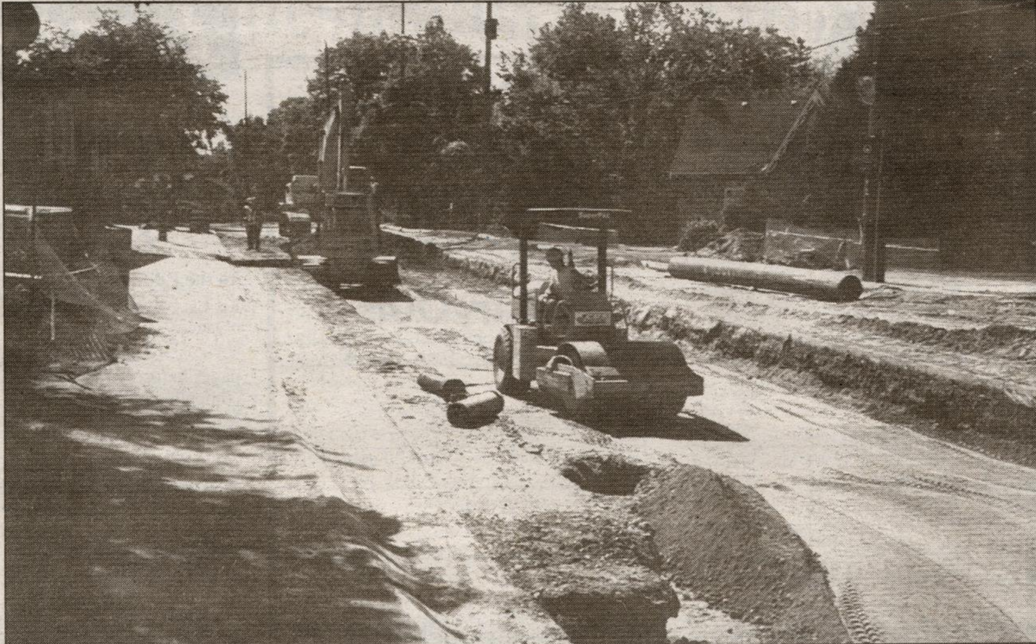
HARD AT IT: Construction crews were busy replacing fill with clean sand preparatory to starting to pave Rockwood's main street next week. Meanwhile high hoe operators with a bevy of supervisors and observers work on opening the trench along the Manse easement between Main and Carroll Streets to replace the sewer and water service. Barring complications, crews expect to begin the repaving by the end of next week.