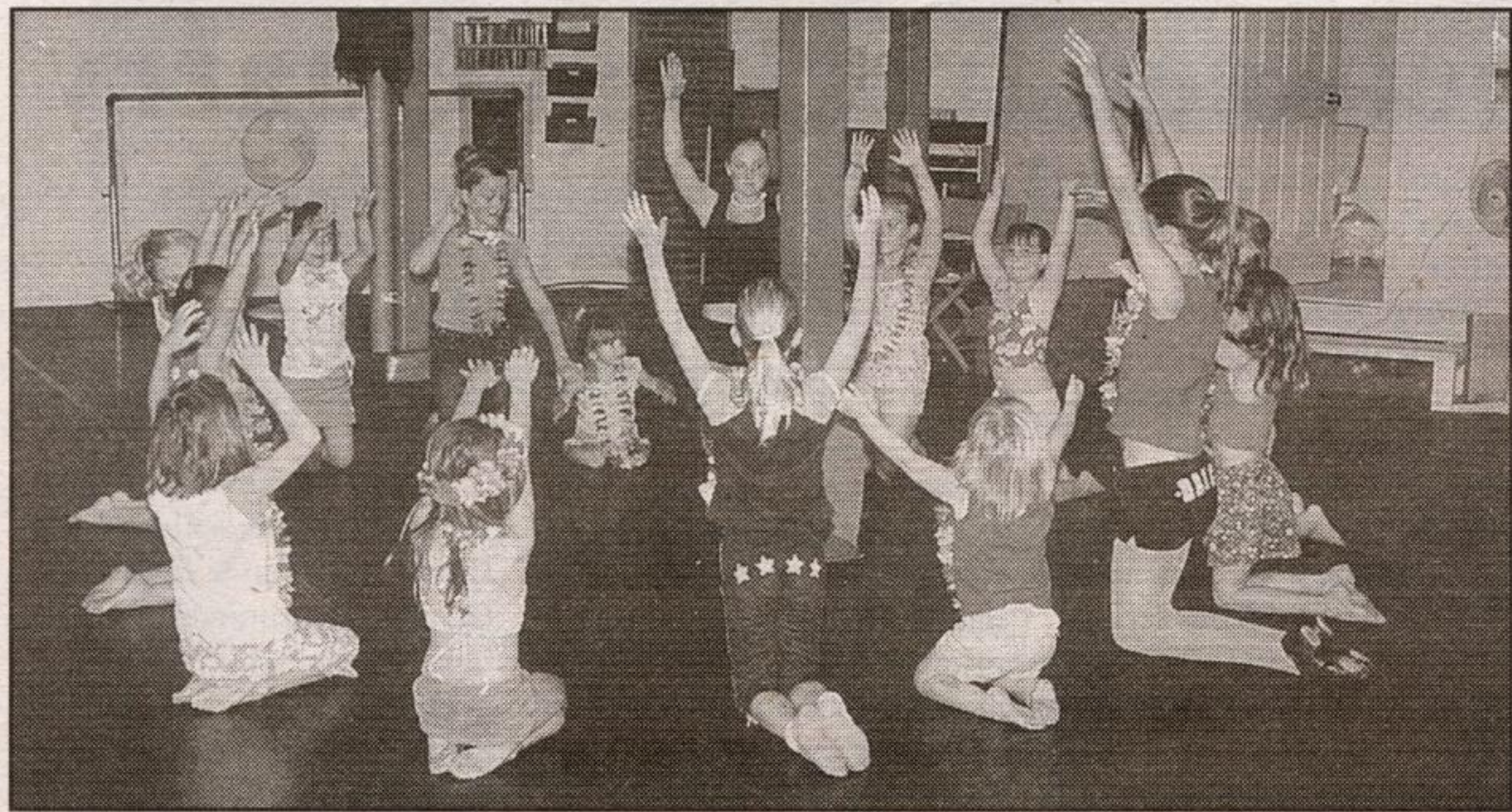
LUAU WOW: Dance Inn Summer Campers performed a Hawaiian inspired dance on Friday, July 23, for the camera. The dance was the culmination of a week's worth of dance lessons and instruction, mingled with arts and crafts. The highly successful camp concluded on Friday, but another camp is scheduled to being on August 4 spaces are still available.