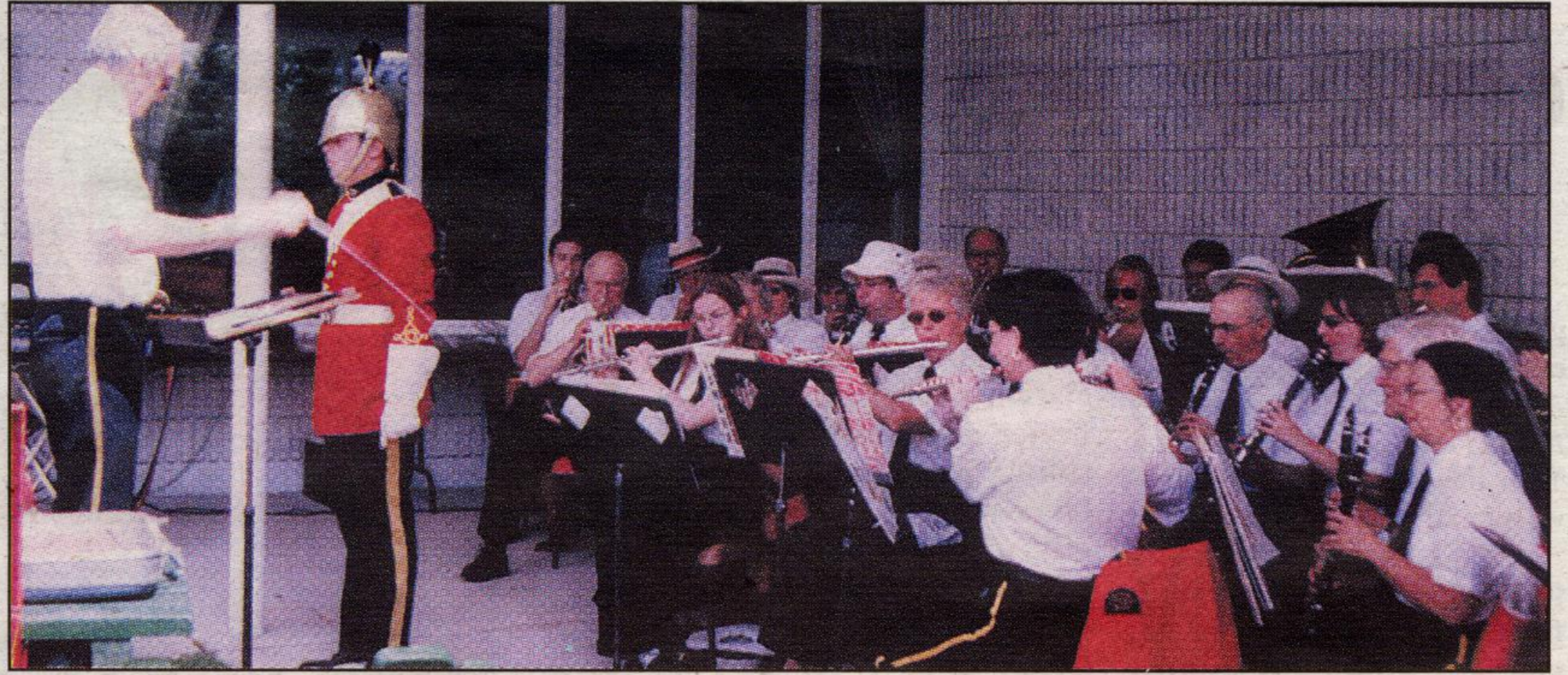
AND BAND PLAYED ON: The Acton Citizens' Band entertained the crowds at the Royal Dragoons annual picnic held at the Acton Legion this past Saturday.

373 Queen Street East, Acton. (519) 853 0558 (across from Sobeys Plaza)