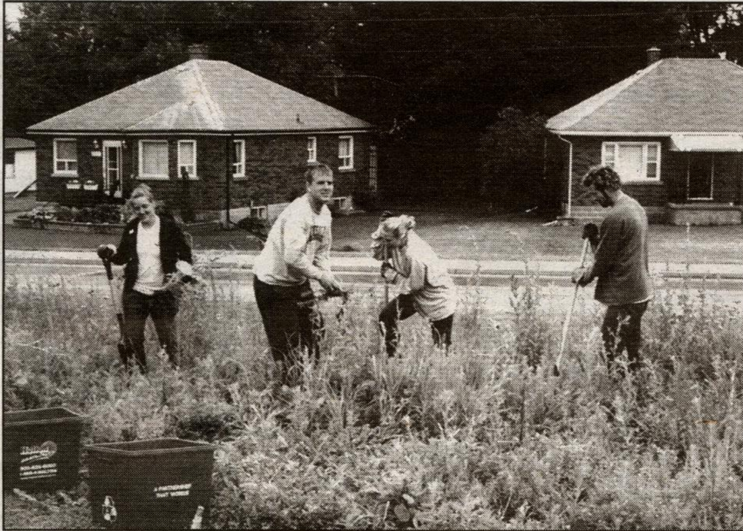
GARDEN GONE: Town recreation and parks staff rips up plants and weeds at a former Communities in Bloom community pride garden on Main Street North at Highway 7. The garden was abandoned and ploughed under when the Acton Horticultural Society determined it could not maintain it this summer.