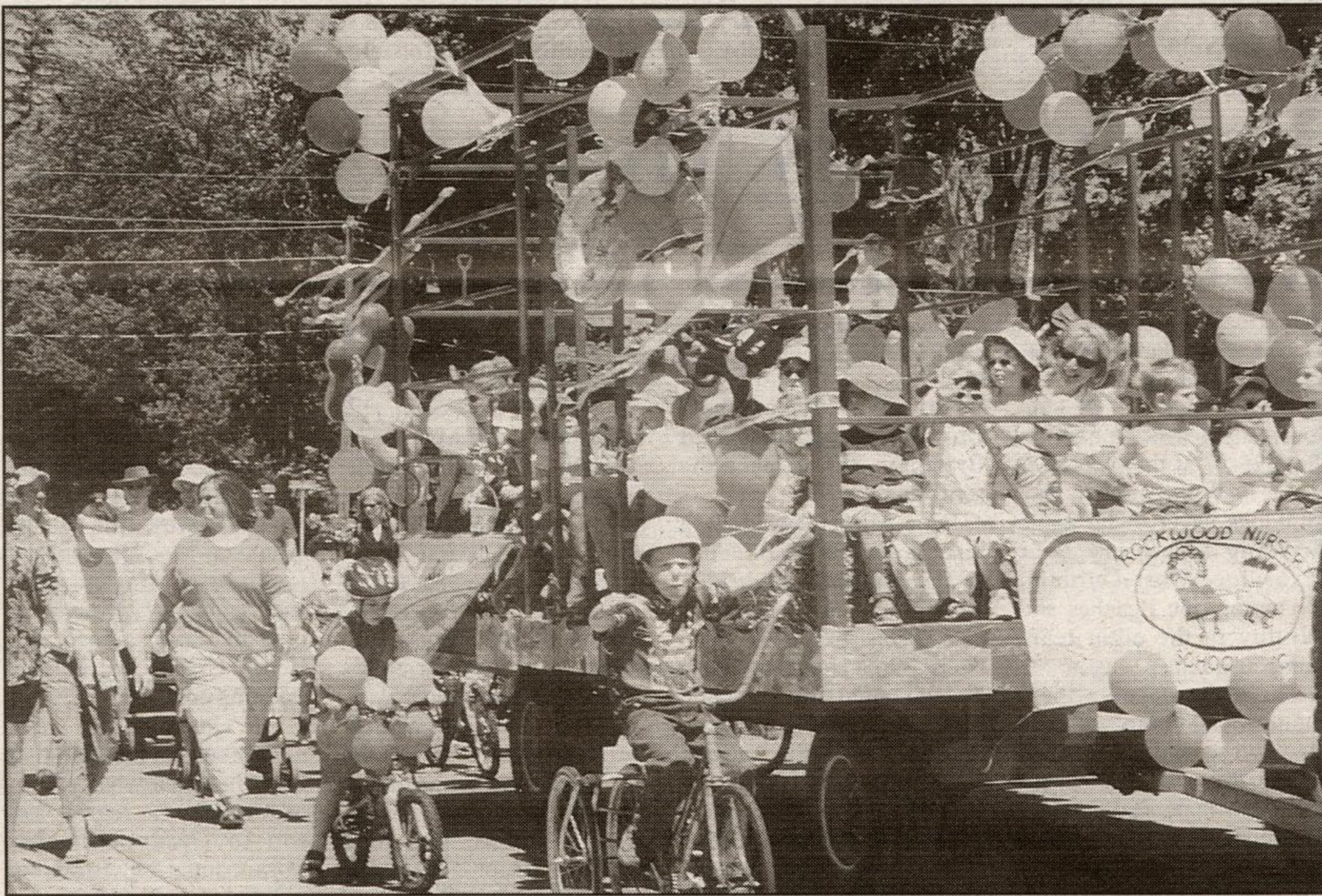
BRIGHT BALLOONS: Rockwood Nursery School's colourful float was part of the Pioneer Days Parade held in Rockwood recently.