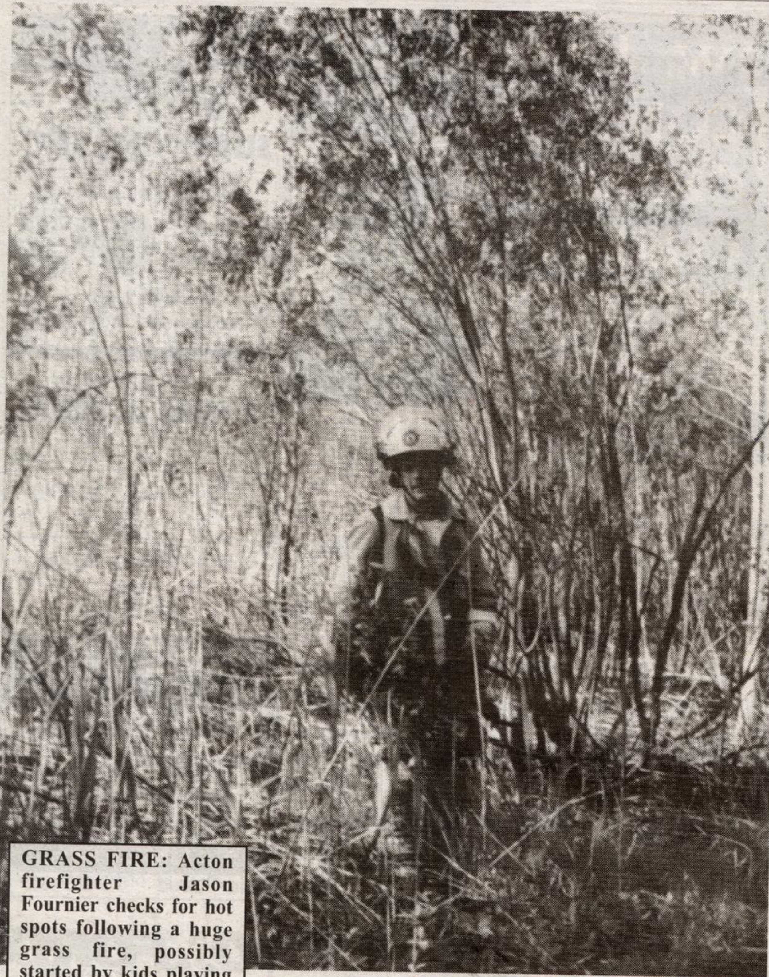
GRASS FIRE: Acton firefighter Jason Fournier checks for hot spots following a huge grass fire, possibly started by kids playing with fireworks, in the dunes area behind Elmore Dive on Sunday afternoon.