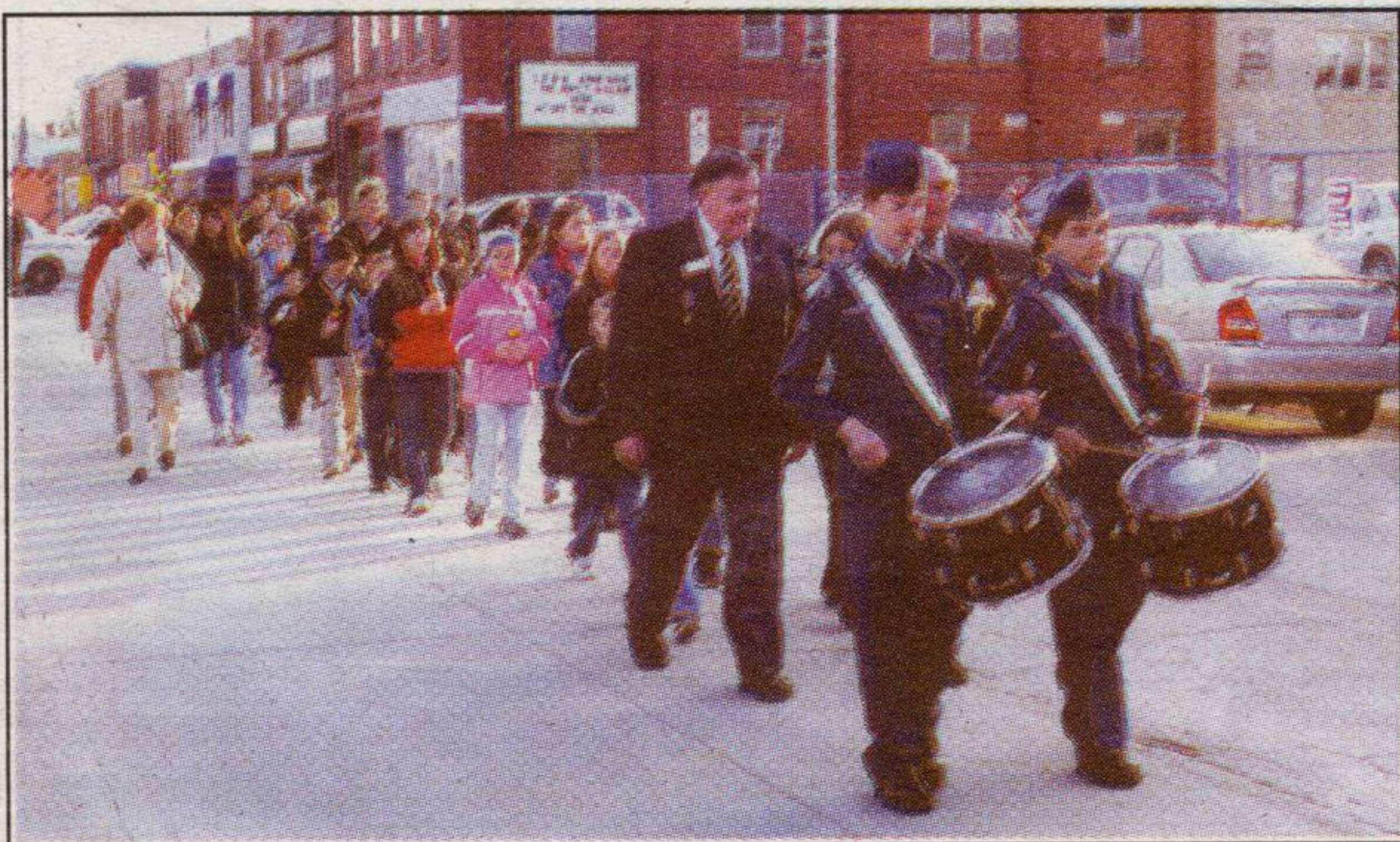
SILENT MARCH: Students, veterans and citizens made their way from St. Alban's Church in a silent march to the Acton Cenotaph on Friday for the second annual Candlelight Tribute to mark EV Day. The students then placed candles around the Cenotaph and thanked the veterans for fighting for freedom.