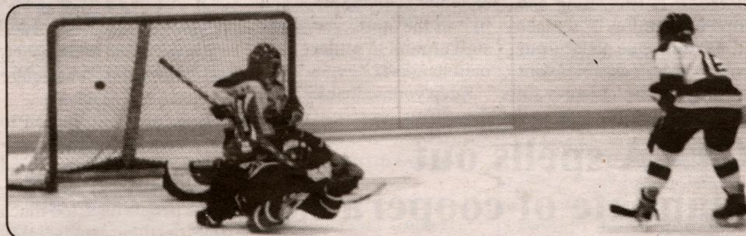
GOAL CREASE-Y'D: Dylan Creasey's shorthanded breakaway goal early in first period was the winner as Acton buried host Goderich 7-0 in Young Canada Consolation Final.