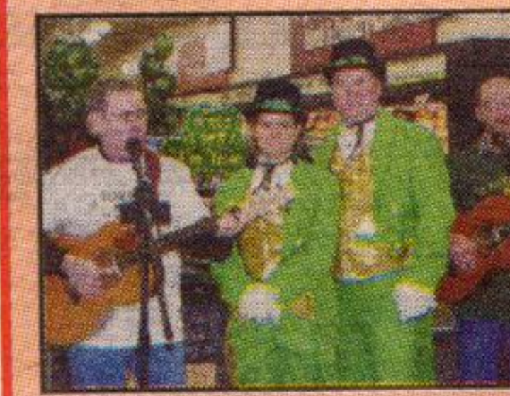
St. Patrick's Day was yesterday (Wednesday) but Sobey's celebrated Friday with traditional Irish garb and a band. See Page 9.

Emailing the New Tanner? The address is: thenewtanner@on.aibn.com Phone 853-0051 Fax 853-0052