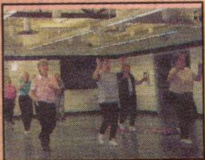
Seniors cut a rug at fitness classes led by Robert Little students. See Page 3.