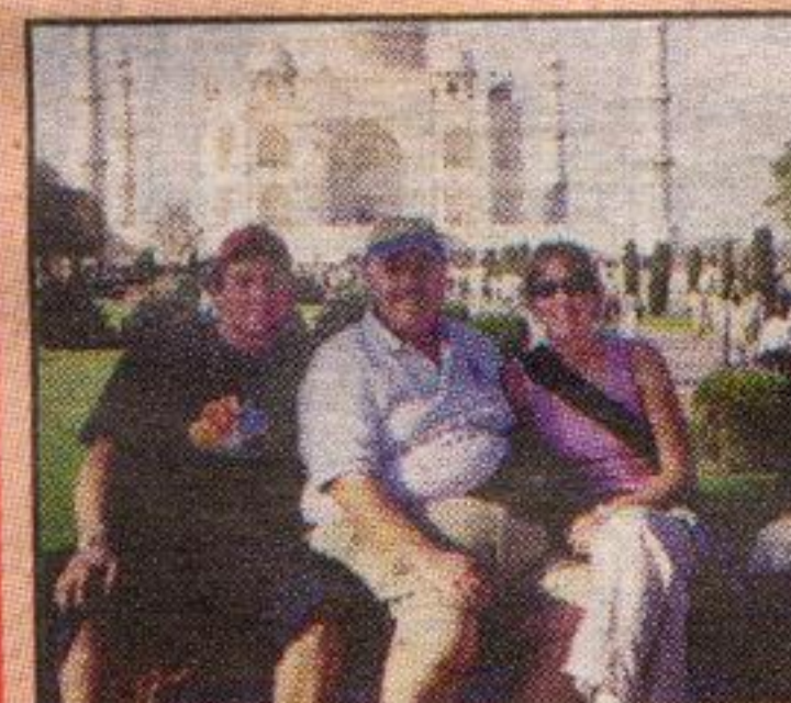
Acton Rotarians and friends went to India recently to administer Polio vaccine to children. See Pages 8 and 9.