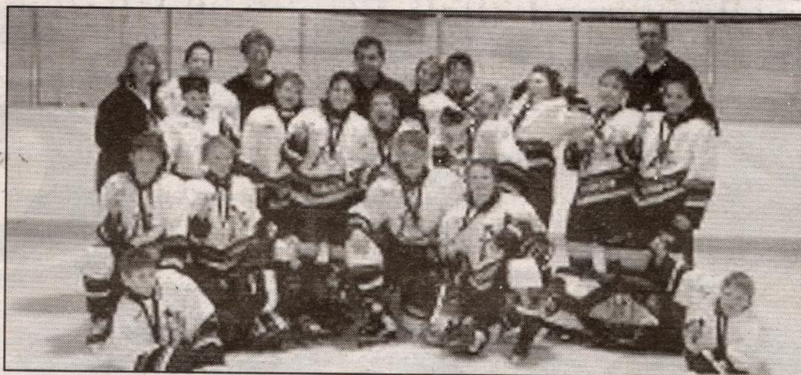
Peewee team celebrates after winning gold at a one-day tournament in Arthur. The club never allowed the opposing team one goal