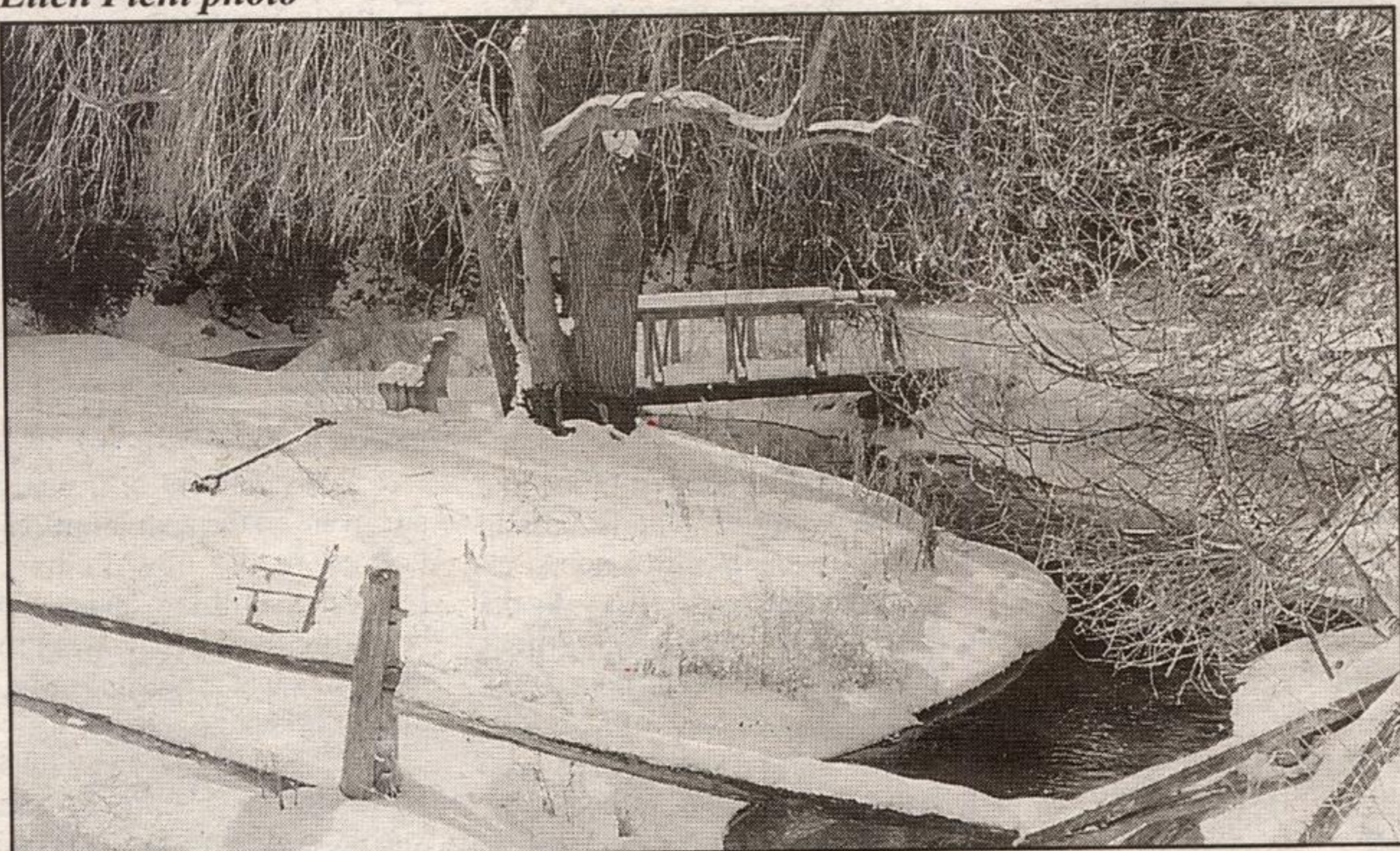
TOO LATE TO MOW: This rustic bridge over a Fourth Line stream caught The New Tanner cameraman's eye. A further look saw a lawn mower and lawn chair suggesting someone meant to cut the grass but all this white stuff descended - and he or she just gave up.

For more information please call (905) 873-2601, ext. 2267.