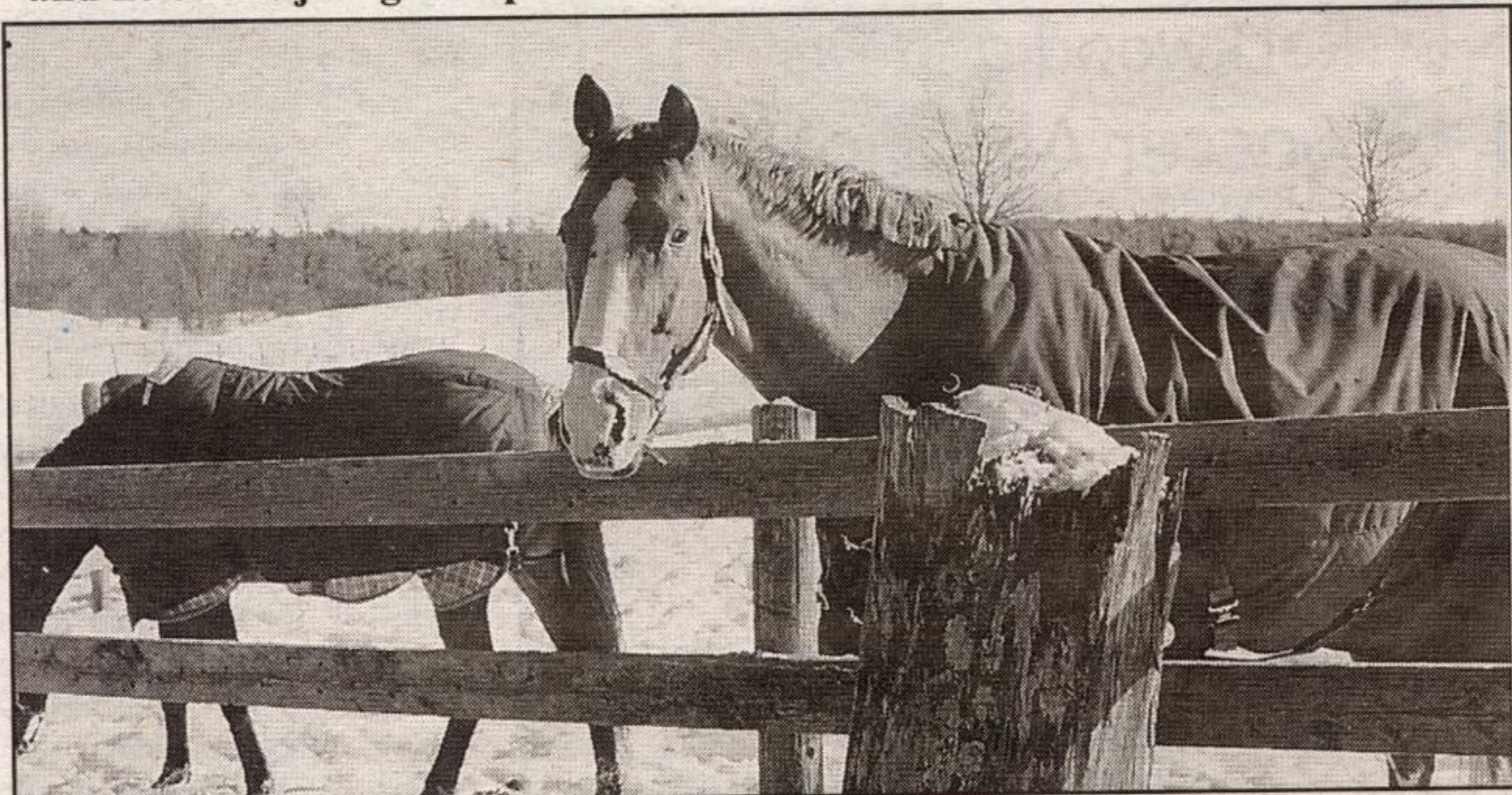
HEY BUDDY:-WHAT'S YOUR PROBLEM: These horses on a Limehouse farm, wearing warm blankets, were just as inquisitive as the photographer when he tried to capture them through the lens