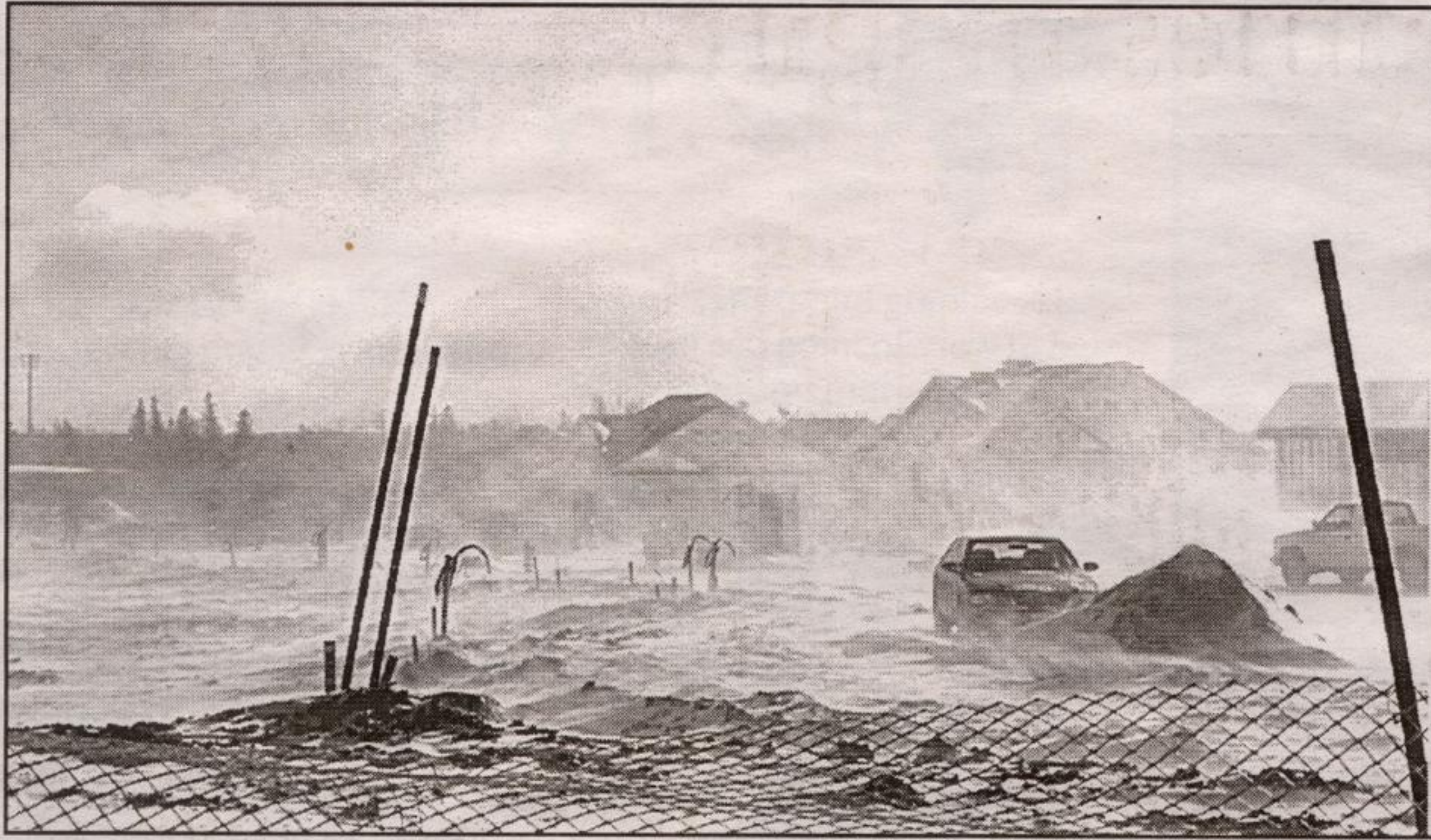
SNOWY BLASTS: Bone-chilling gale force winds, which often caused white-outs, swirled around this week as winter returned to the area. This construction site on Wallace Ave. was busy despite conditions.