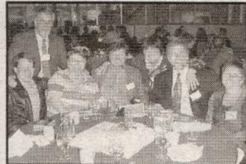
Acton High School Reunion

The Town agrees to set up an ad hoc citizen committee to review operations at its cemeteries after staff, for the second time, remove personal effects from graves at Fairview Cemetery, without prior notice.