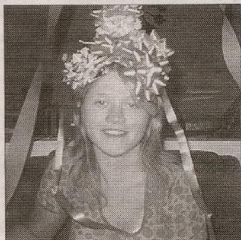
Nifty Fifty! Love, Your Family