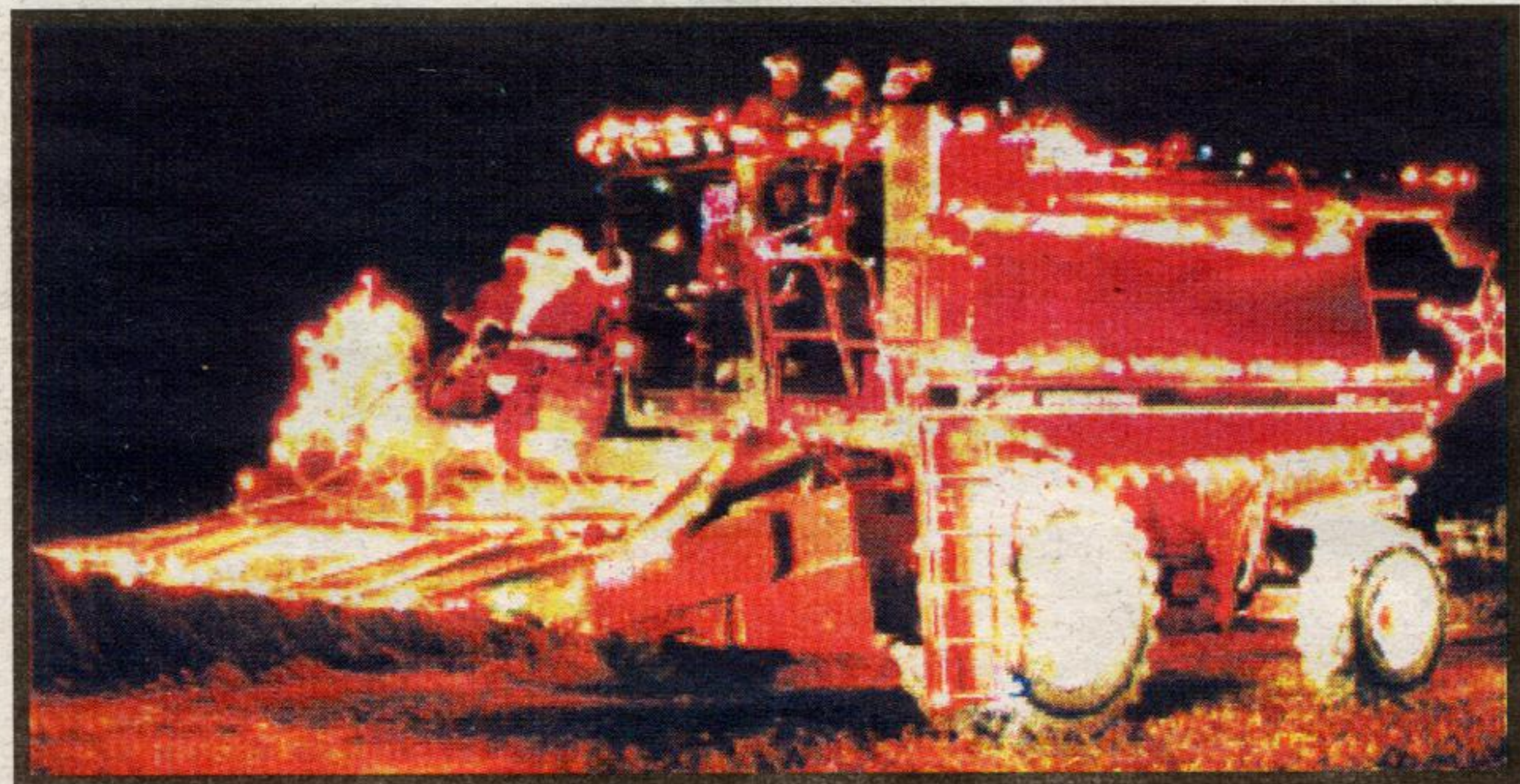
SANTA TAKES A RIDE: Past floats prove to be a delight - even for Santa!

lit parade floats can be enjoyed at the group's website www.blahs.on.ca . The website also contains exact directions to the village and the exact parade route.