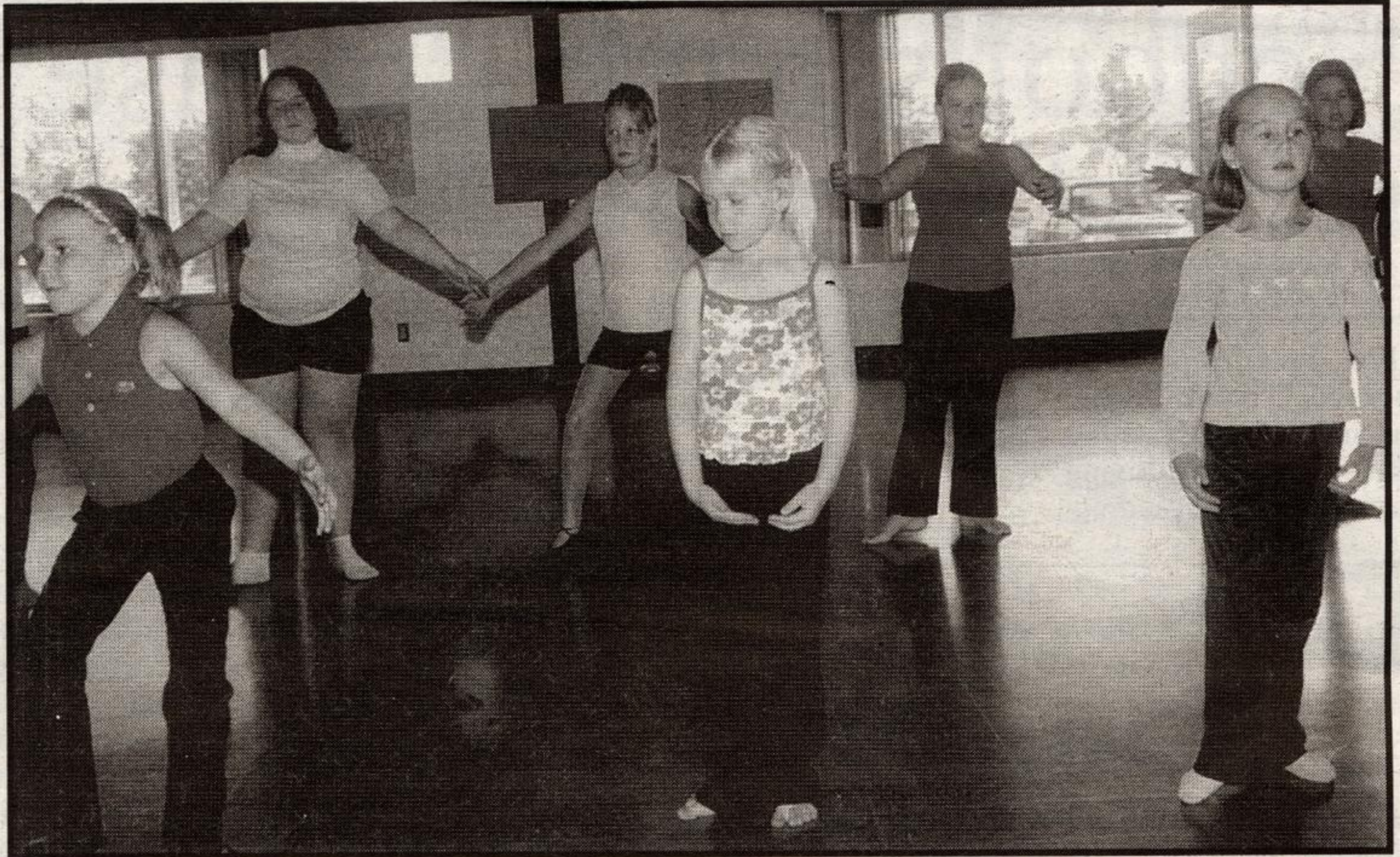
SPICE DANCE: Members of Halton Hills Dance Camp strutted their stuff to music by the Spice Girls during Camp's production of We're All Stars on Friday, August 22 at Acton Community Centre.

The church provides a Story Hour ministry for three-to-five-year-olds and a nursery for pre-schoolers.