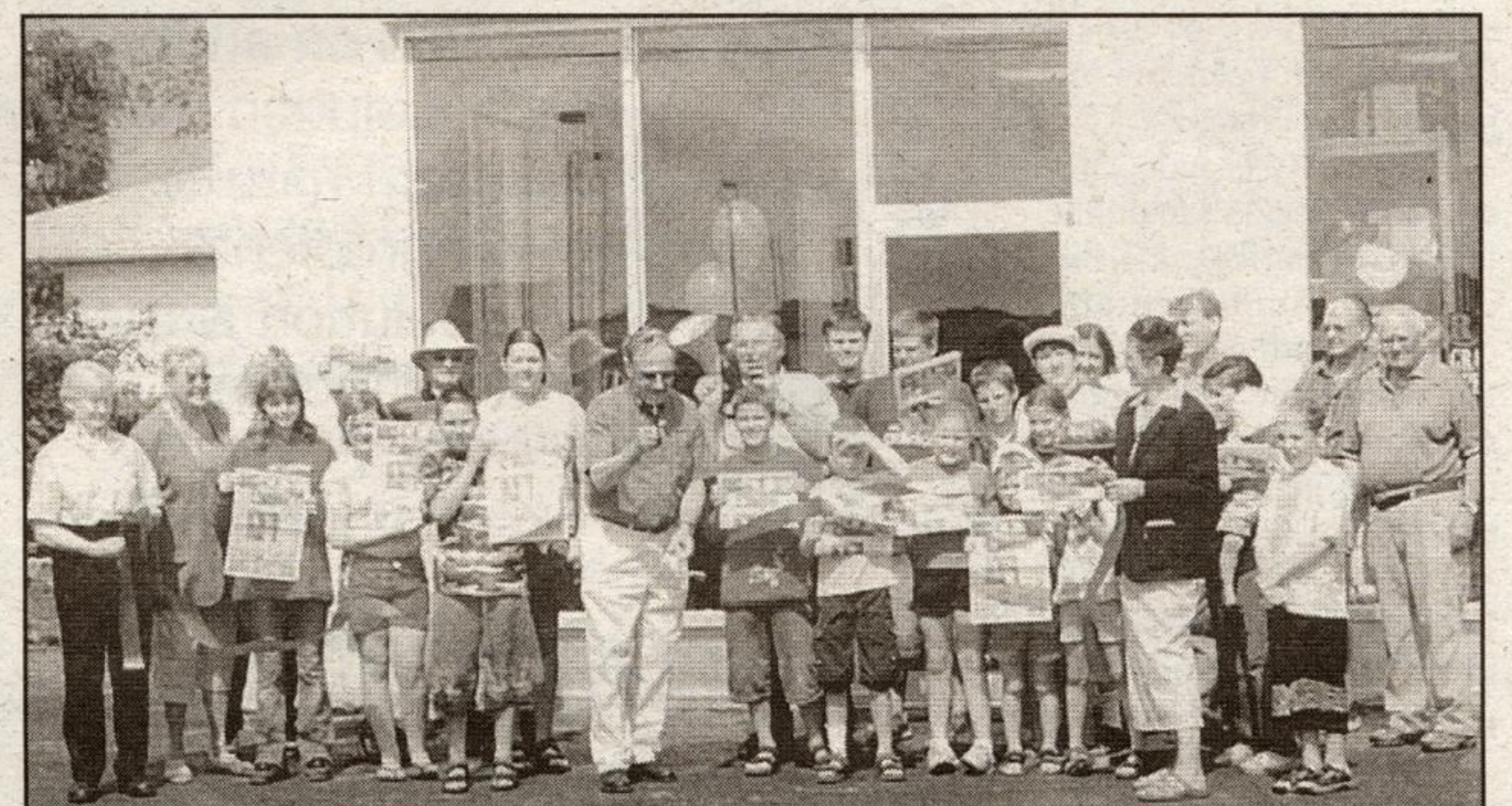
NEW HOME: Staff and carriers of The New Tanner celebrated at the official opening of the paper's new home at 373 Queen Street East, during ceremonies last Thursday.

Along with reluctantly endorsing the CAOs report, Town Council advised Halton it is not in favour of the timing of the transfer of Maple Avenue and River Drive, until Halton identifies an alternate east-west truck route.