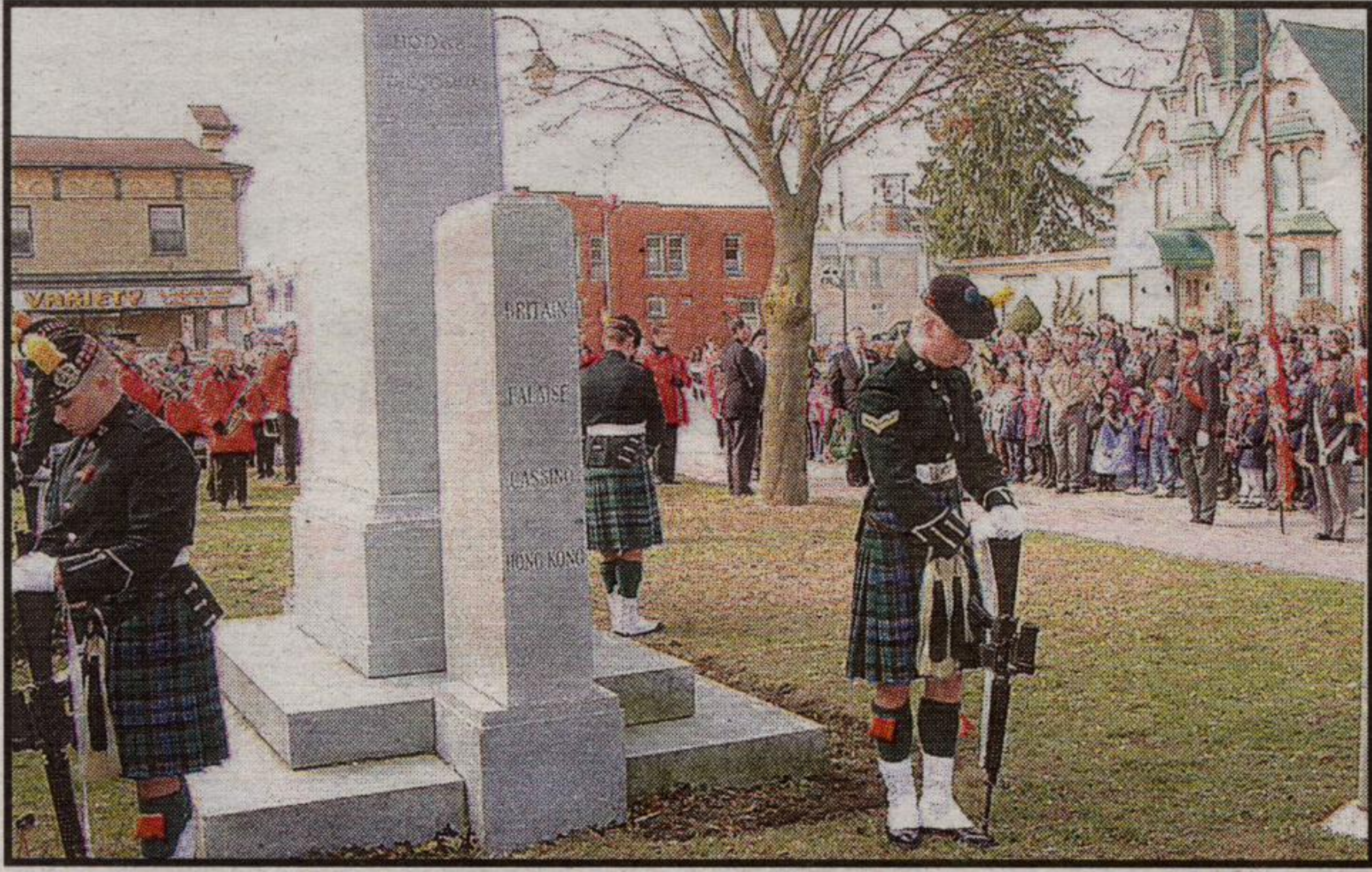
A solemn moment at the Cenotaph