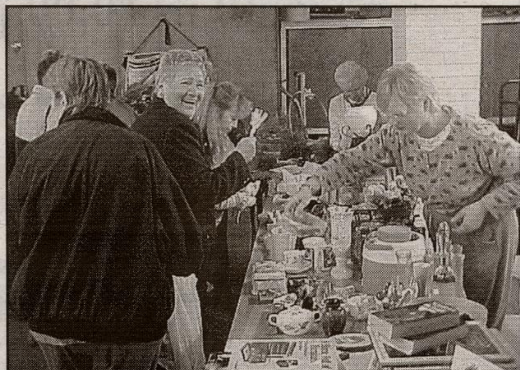
BARGAINS GALORE: Knox Presbyterian Church held their annual Christmas Bazaar on Saturday. Crowds of people showed up for the crafts, baked goods and luncheon.

If you're already dressed for the occasion (Hallowe'en), come on over for a special treat and show your costume off to your friends on October 31.