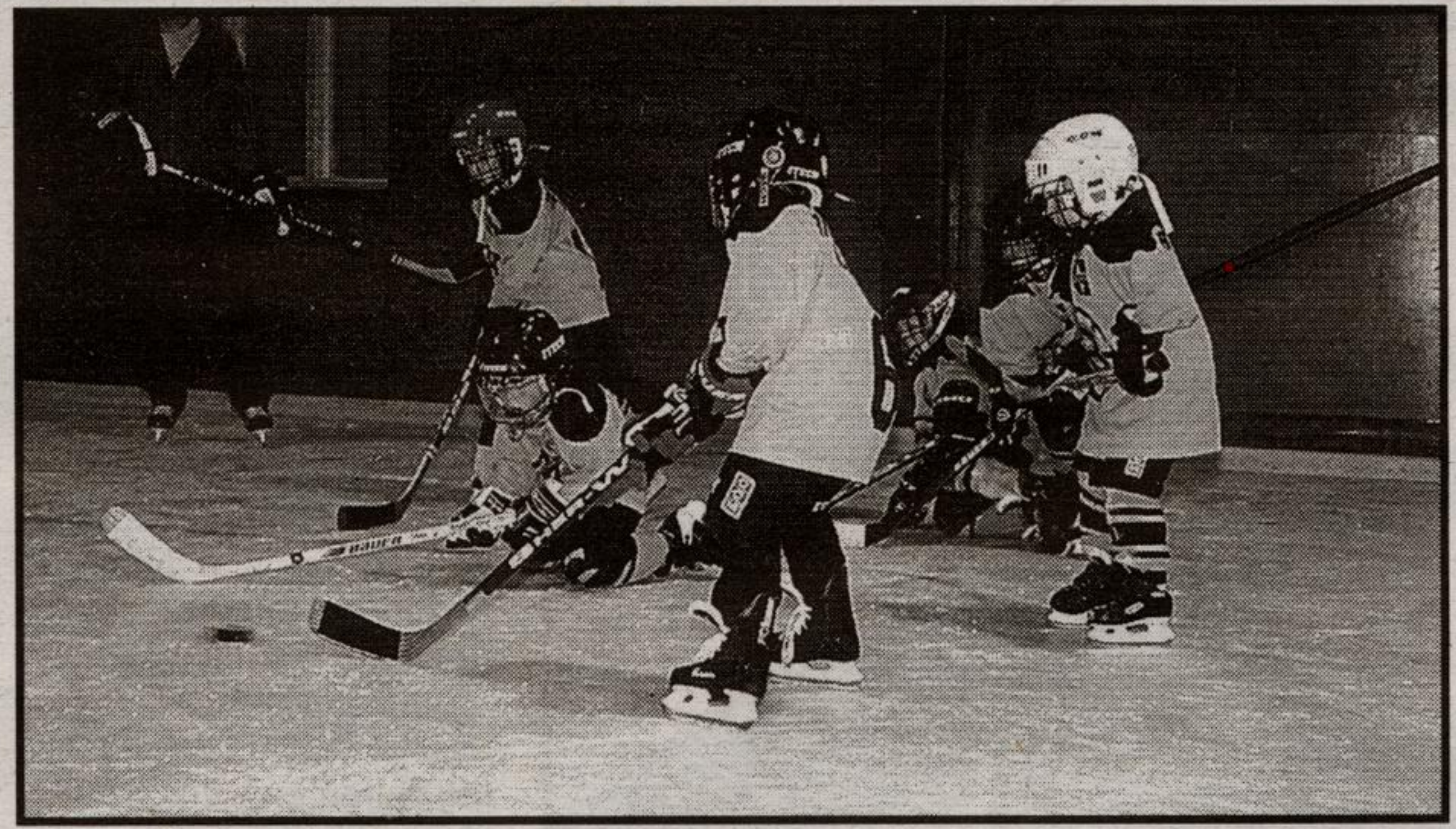
TYKE TRAINING: Getting to the puck usually ended with a puddle of junior Tyke players as Triplus Financial Services of the Georgetown house hockey league practiced on the leisure pad at Acton arena on Sunday.