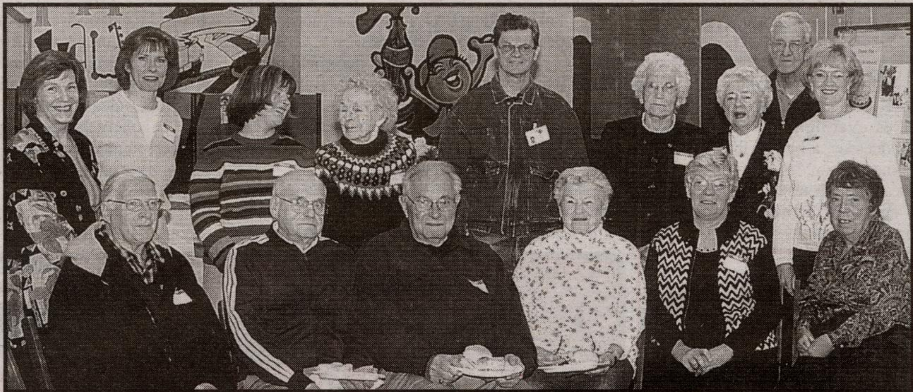
MEALS ON WHEELS: On Tuesday October 8, Meals on Wheels in Acton celebrated their 25th anniversary with an appreciation luncheon for volunteers from the past 25 years and the present. Meals on Wheels delivers lunch to clients in Acton daily. Each client received a long stem rose with their delivery on Tuesday to commemorate the occasion.