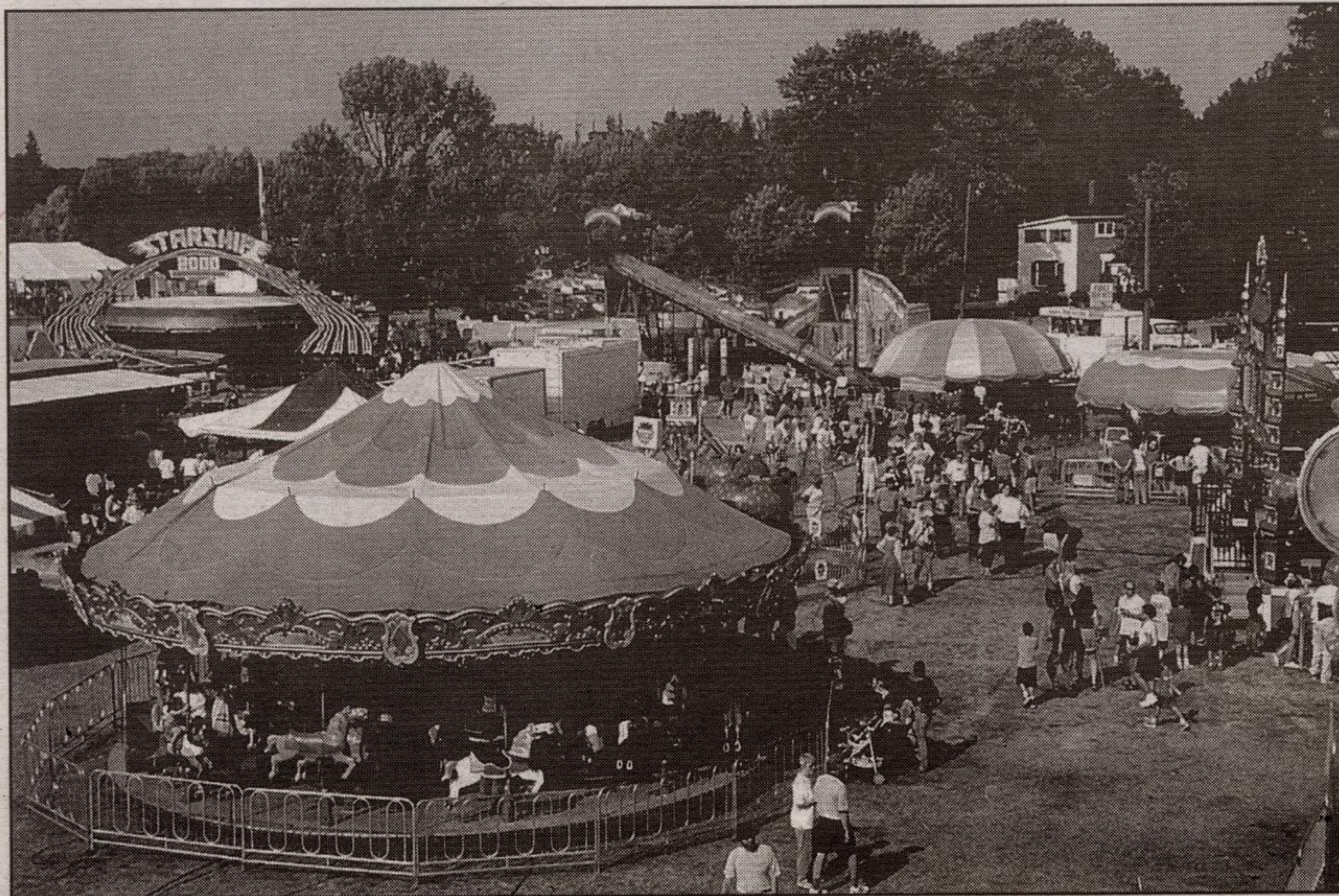
COUNTRY COLOUR: A mix of sunny skies and lots of rides on Saturday was the right combination for entertaining fun in the midway.