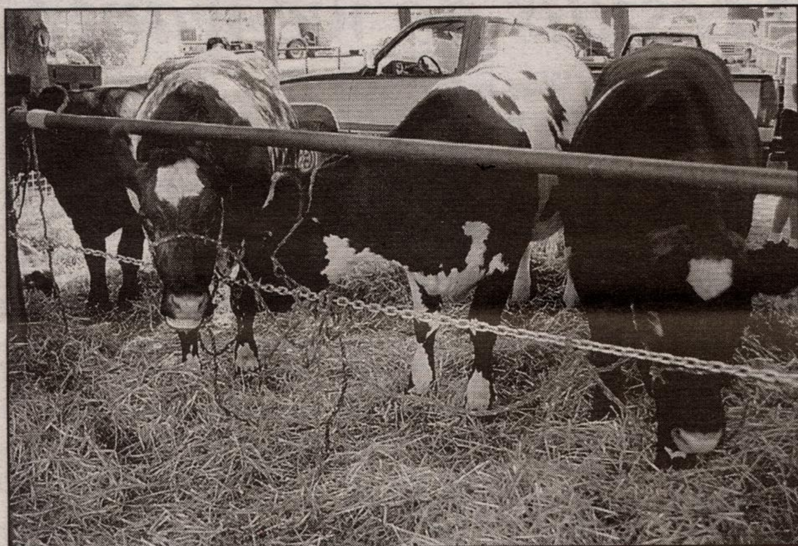
JUDGEMENT TIME: Although the cattle were small in number, handlers and owners had the animals groomed ready for judging on Saturday.