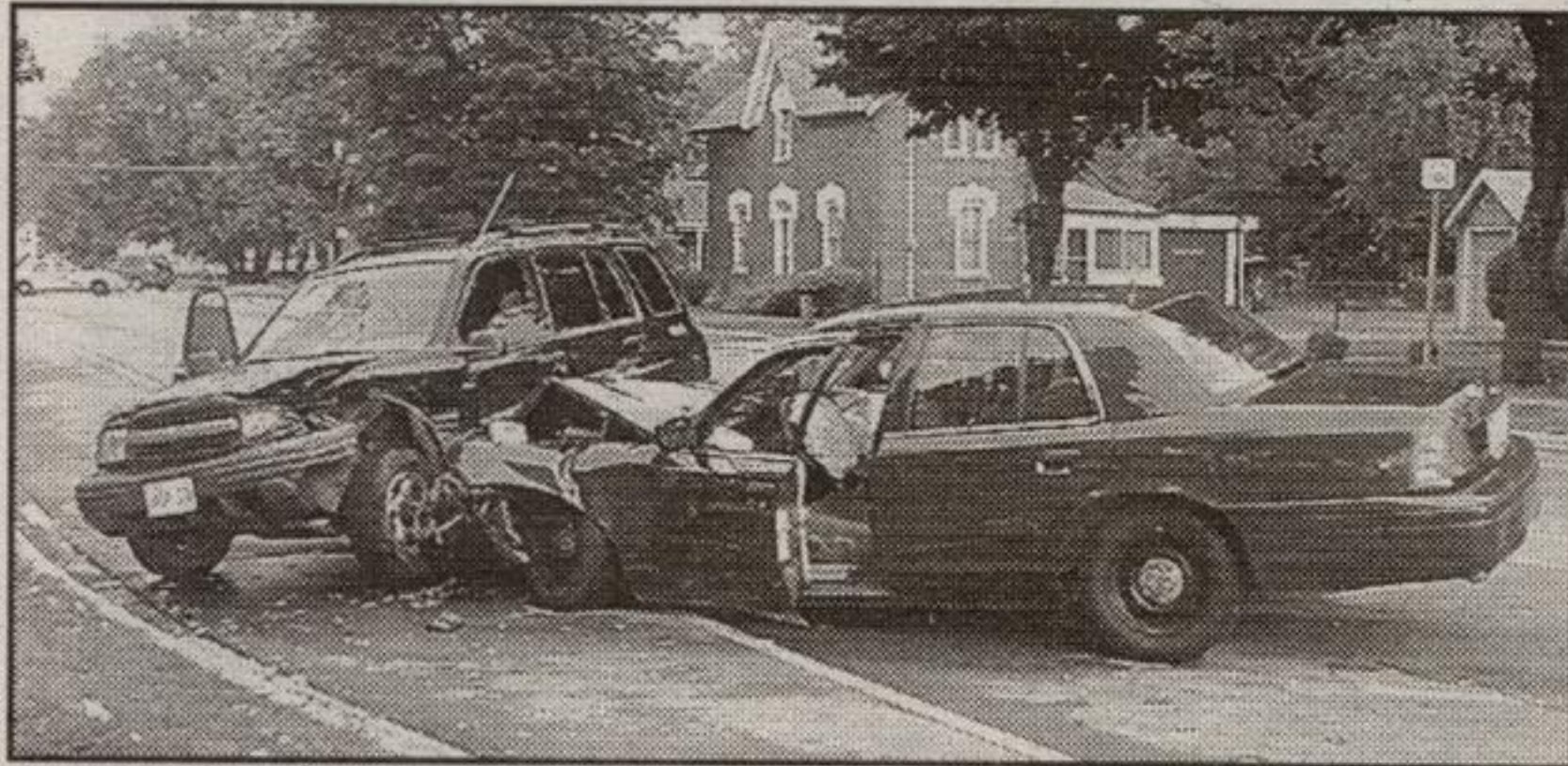
INJURY ACCIDENT: The Ontario Special Investigation Unit is monitoring Halton police's investigation into a personal injury accident between an unmarked police cruiser and a Chevrolet Tracker on Young Street at Eastern Avenue early Sunday morning. More than six hours after the accident, the vehicles had not been moved.