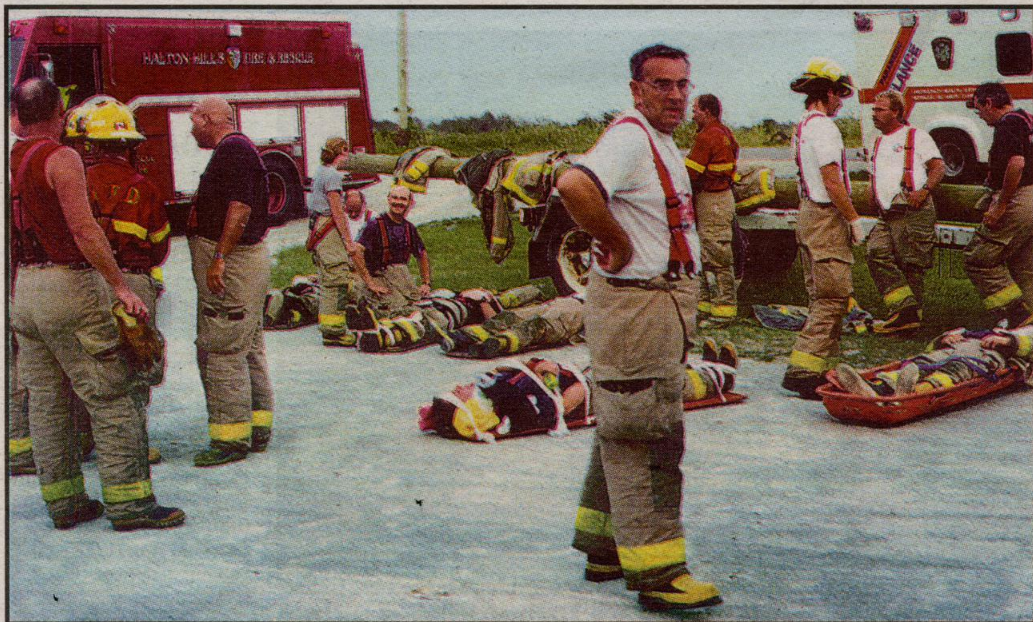
READY AND ABLE: "Taking care of your own" was the theme of a mock training exercise, in Acton recently, for members of the fire department's emergency patient care team. Firefighters cared for a "victim," a downed colleague injured responding to a simulated explosion and fire.