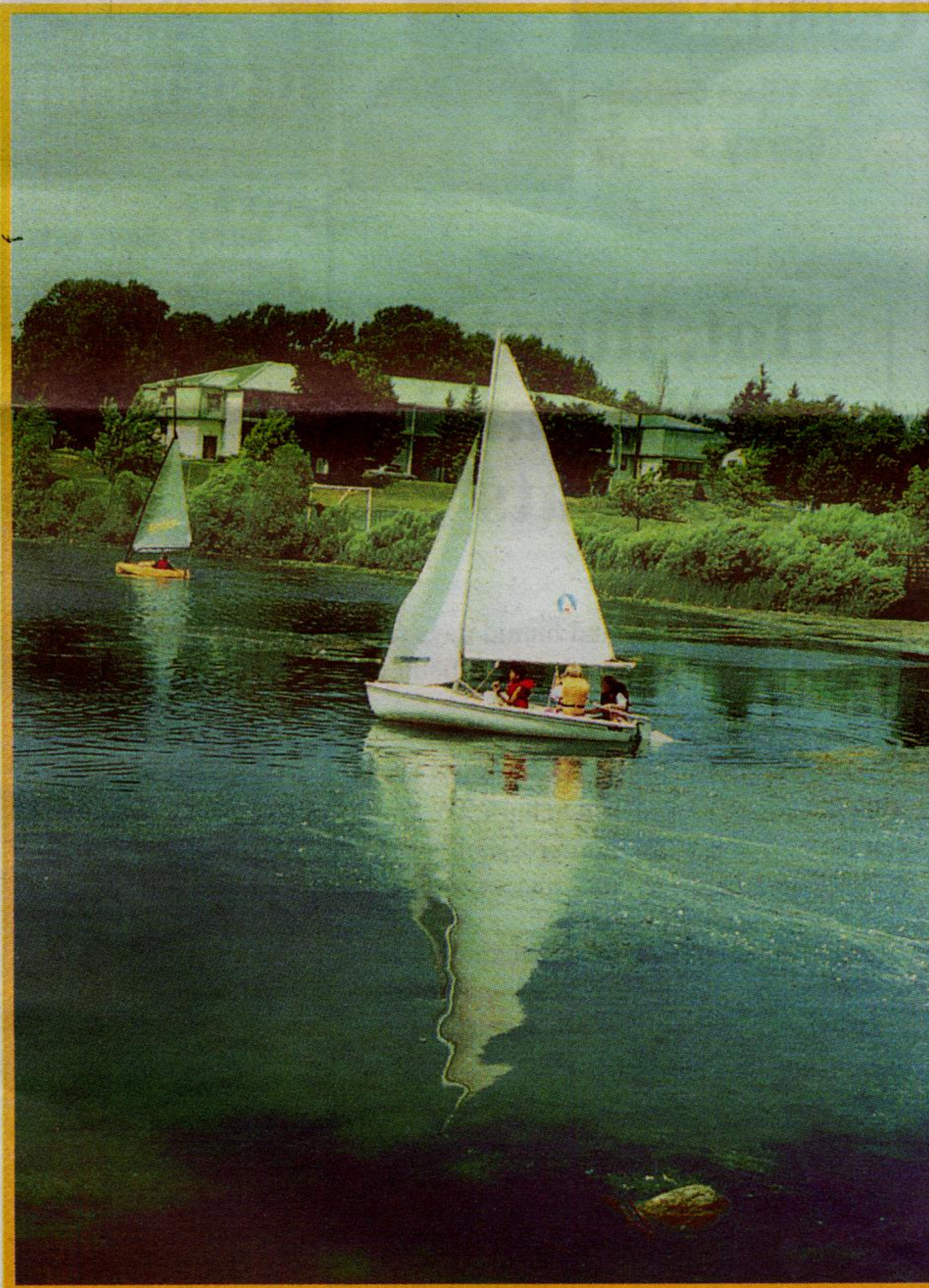
LAKE BREEZES: Budding sailors taking sailing lessons on Fairy Lake found a good way to cool off in the sweltering heat this week. Story and more photos on Page 13.

Avoid areas with high mosquito populations and take extra precaution from dusk to dawn when mosquito activity is particularly high.