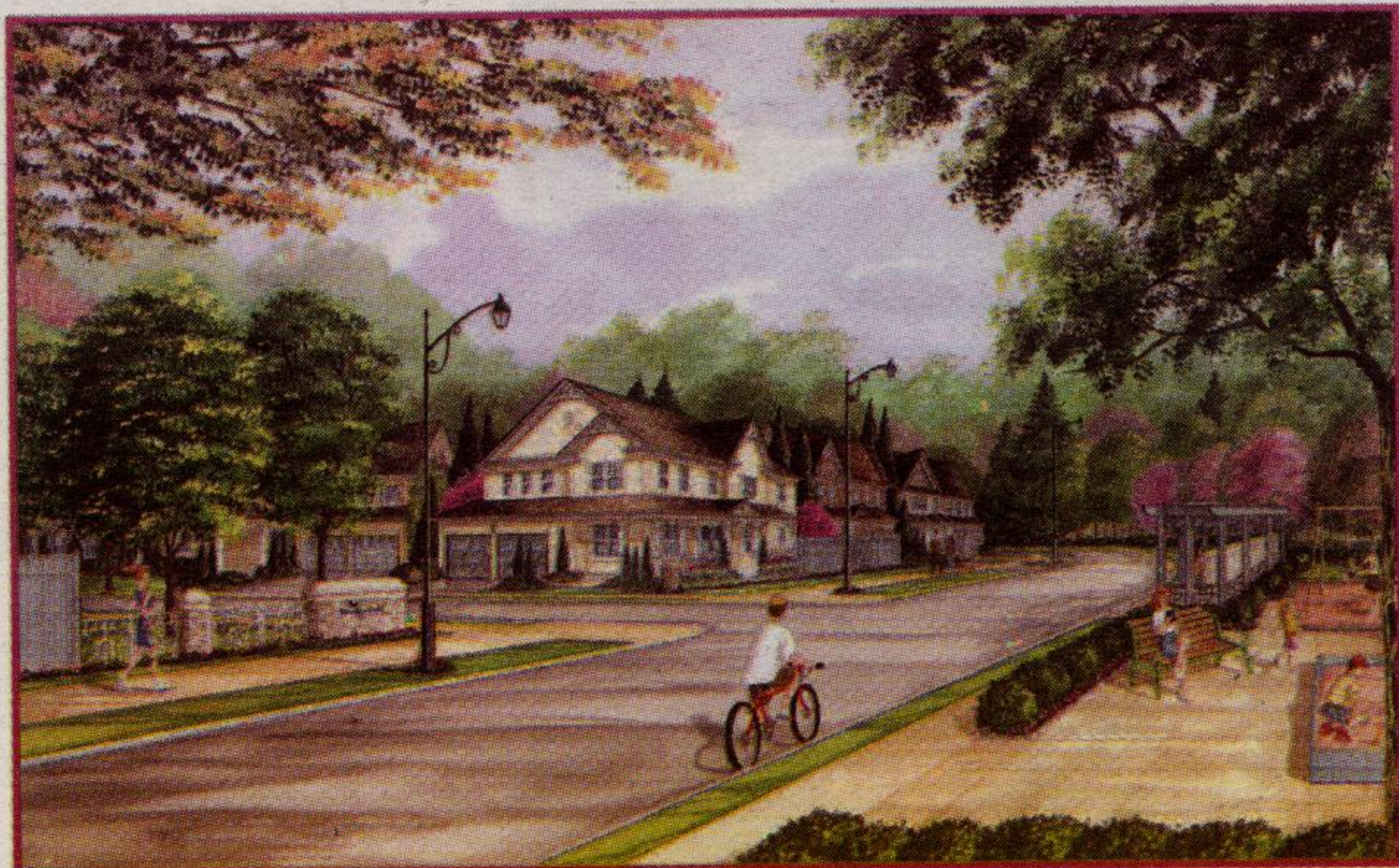
Artist's conception of Honeyfield

At least 14 houses have sold in the 50-lot phase one of the development and more than 400 people attended pre-