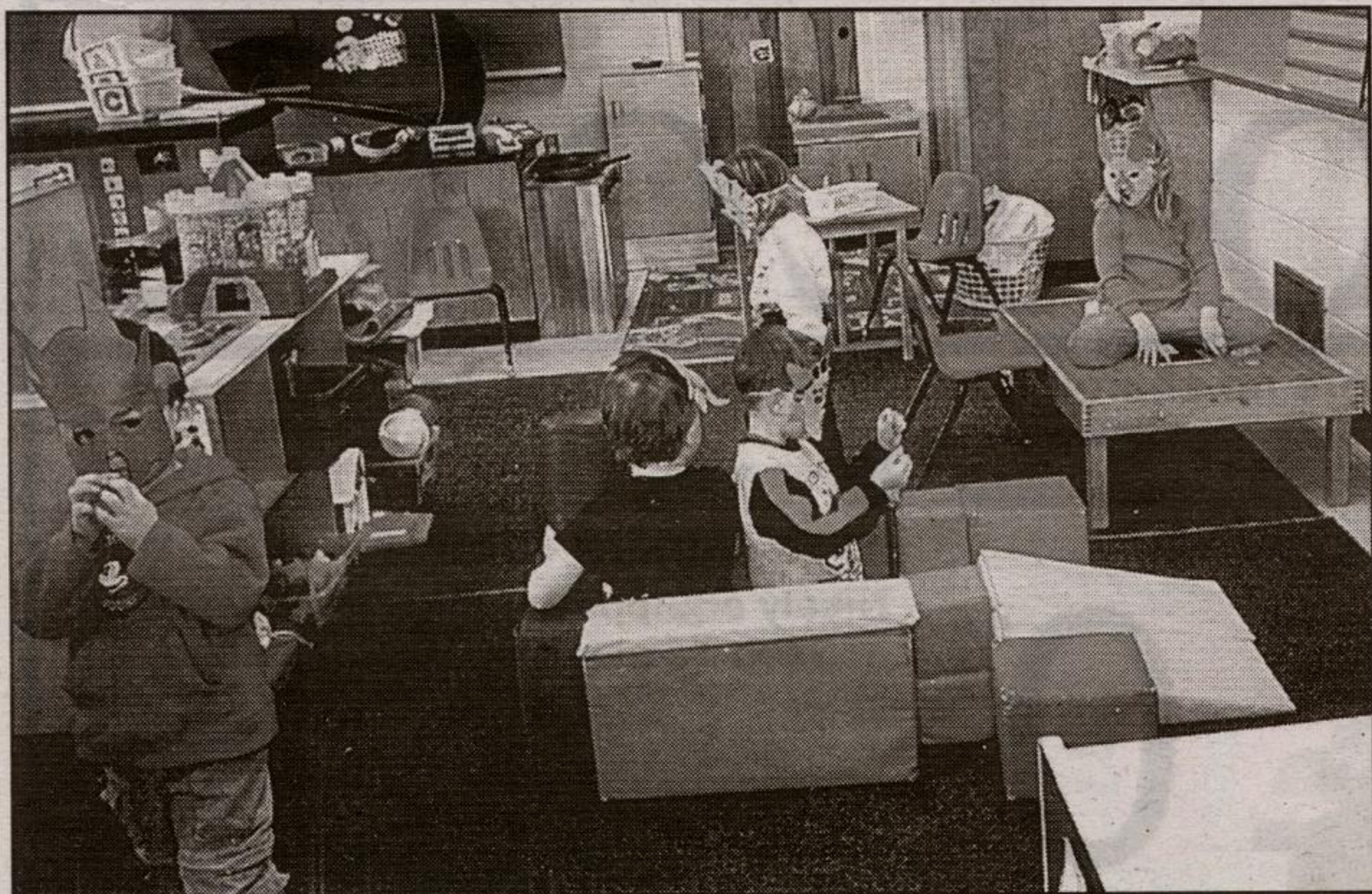
Y SHUTDOWN: Parents of children like these, seen playing with the dinosaur masks they made at the Acton Y Junior Day Care will have to find new care of the kids because the Y of Greater Toronto is cancelling pre-school programming in Acton as of June 15.