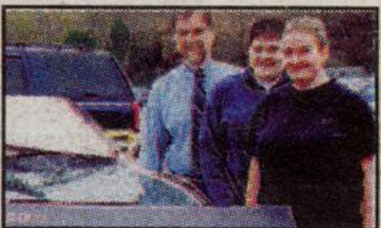
The focus is on substance abuse at Acton High School. See Page 2 for story