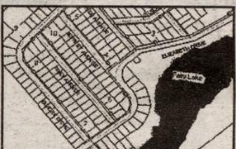
Water woes in Lakeview subdivision were thoroughly explored at a meeting last week. See Page 4