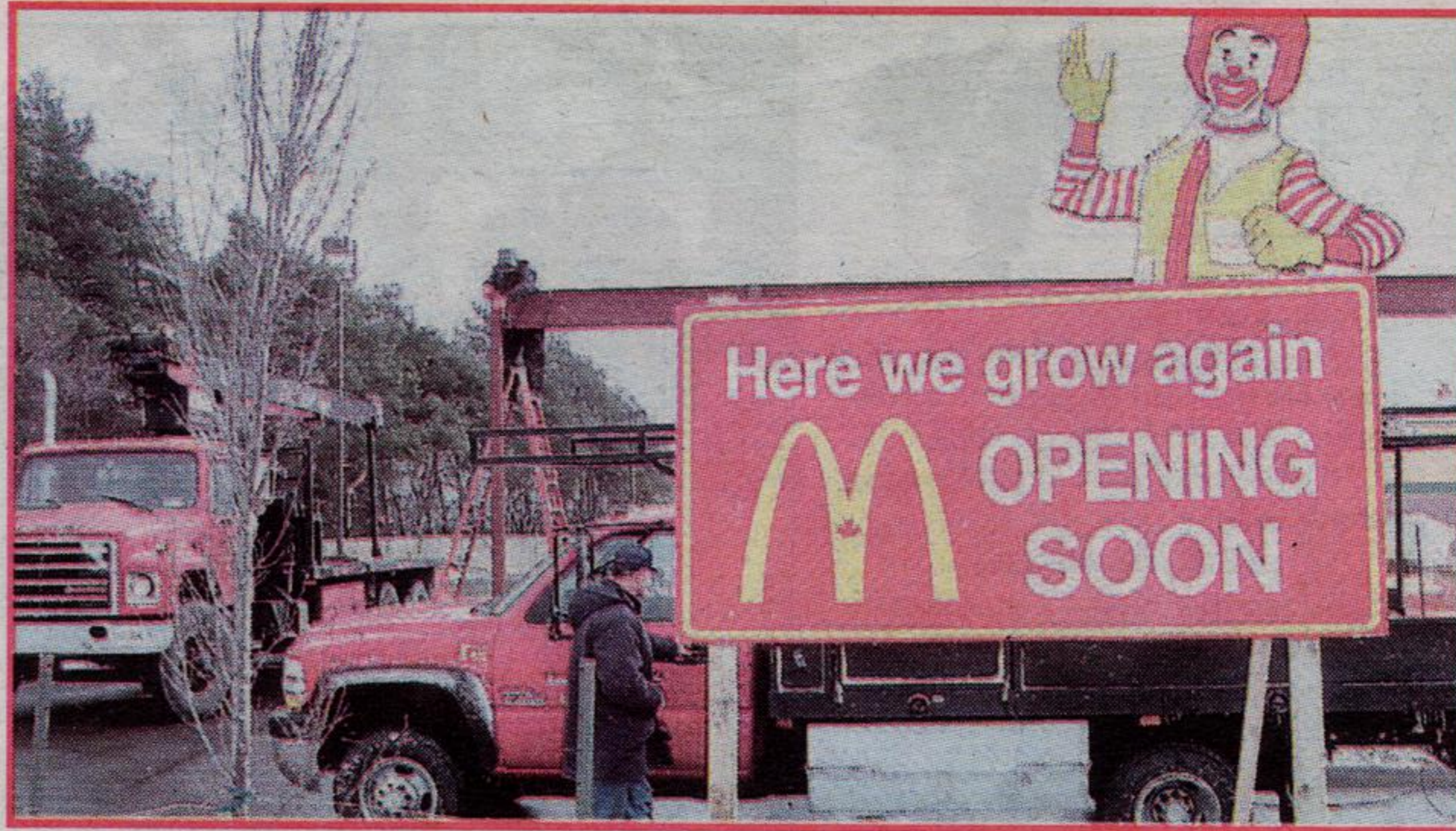
RONALD'S RESIDENCE: Construction has started on the new McDonald's Restaurant in east Acton.